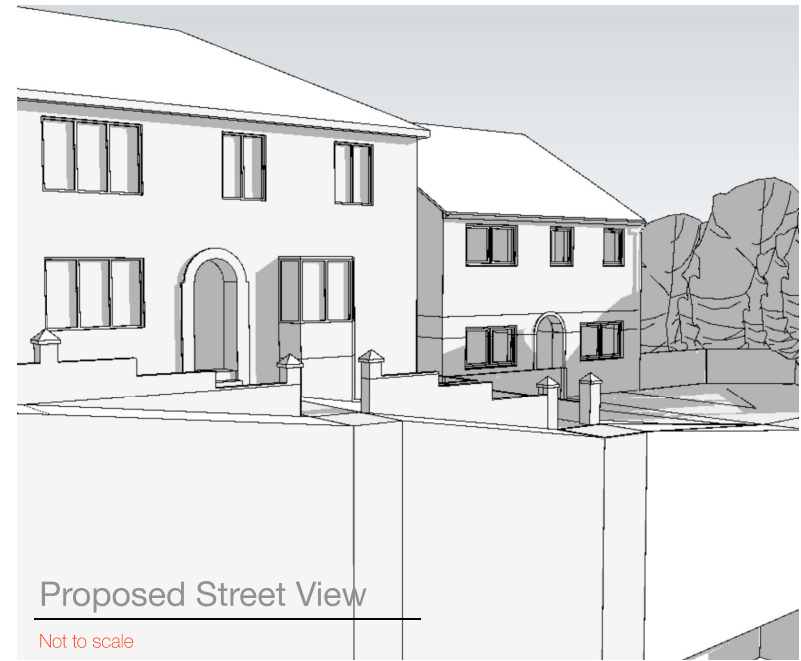
Proposed Street View