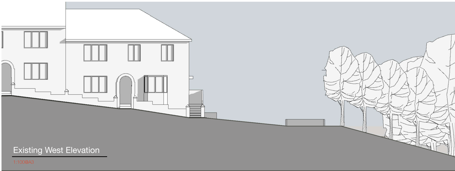
Existing West Elevation