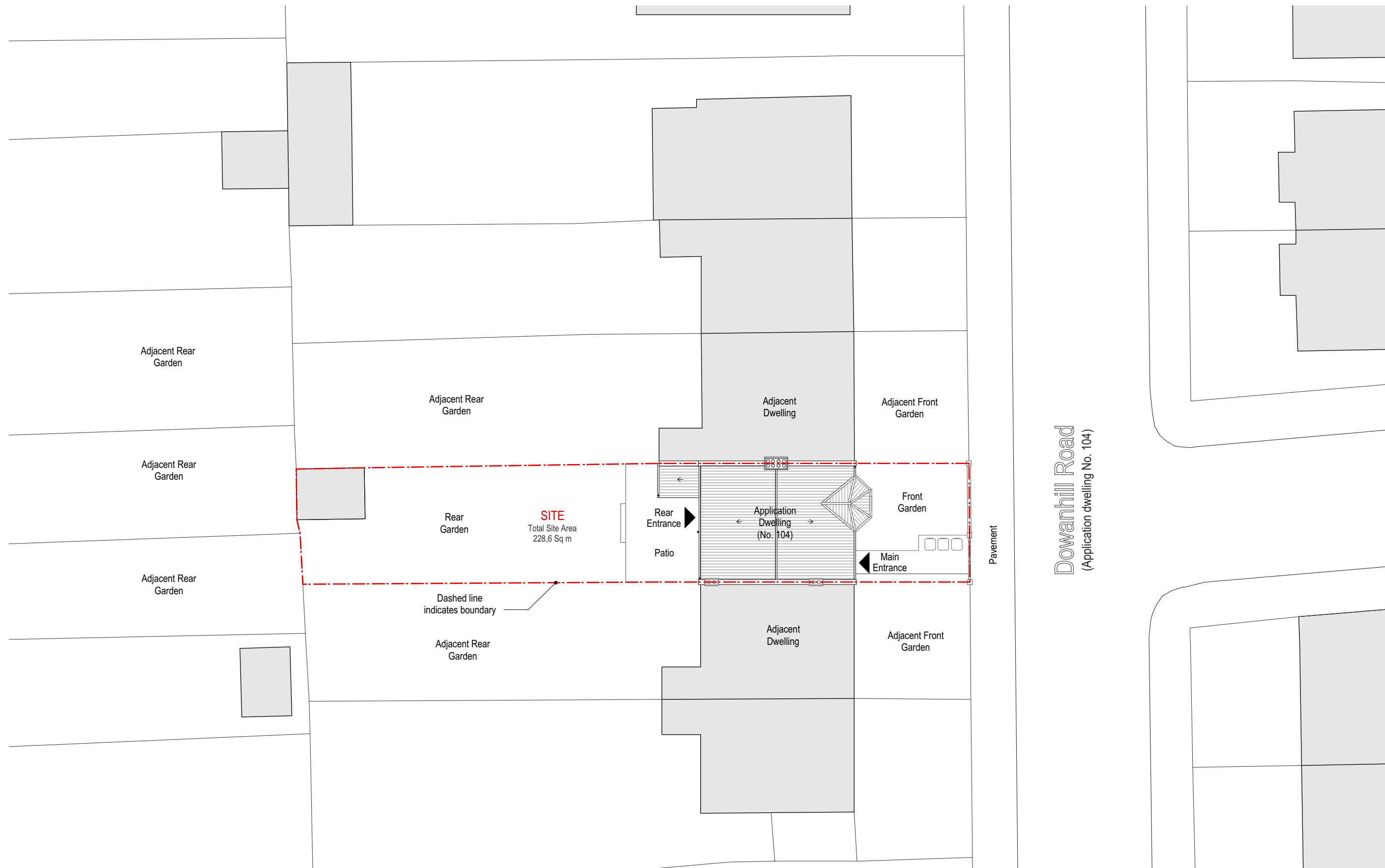
Existing Block Plan 1:200