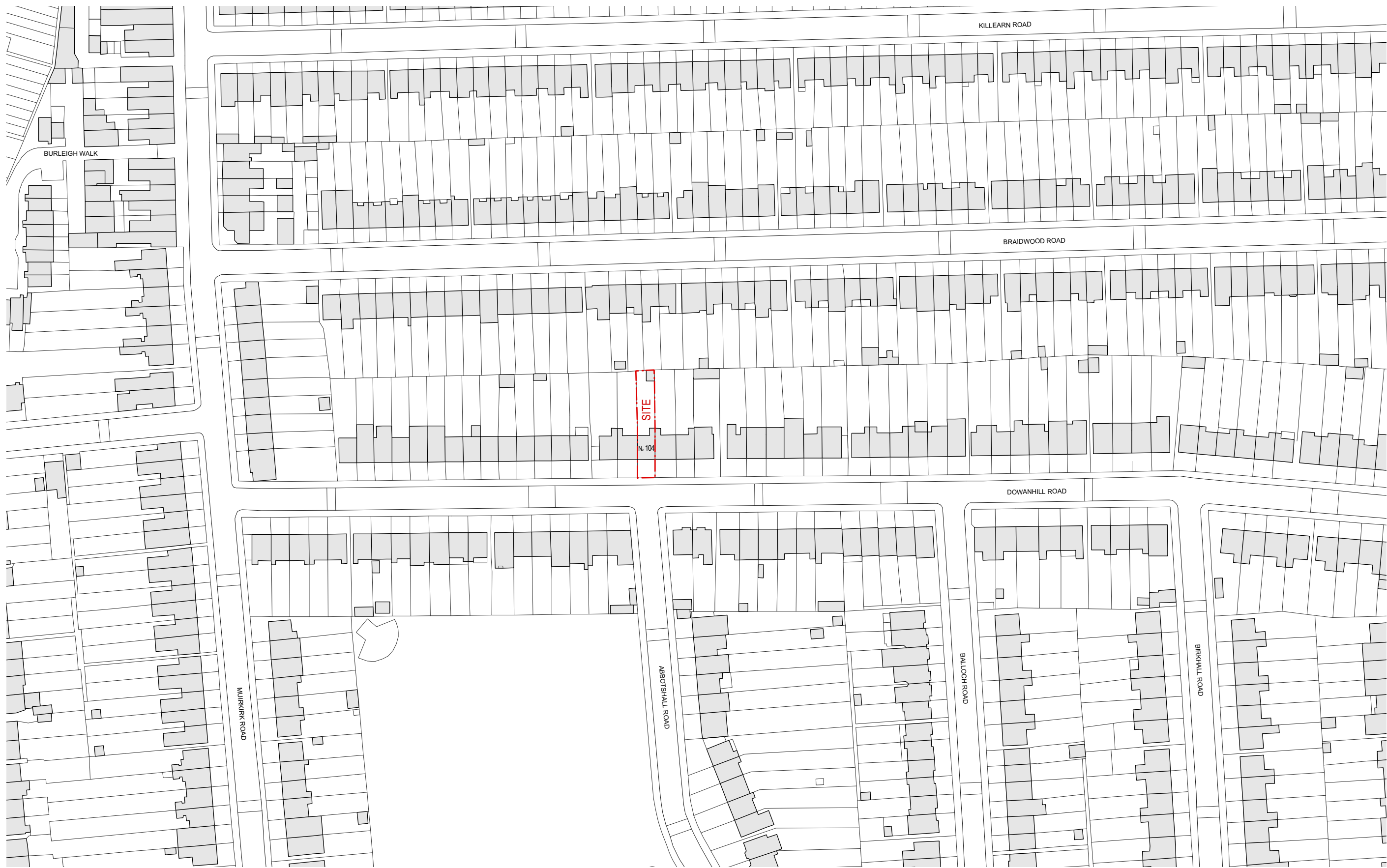
Existing Location Plan 1:1250