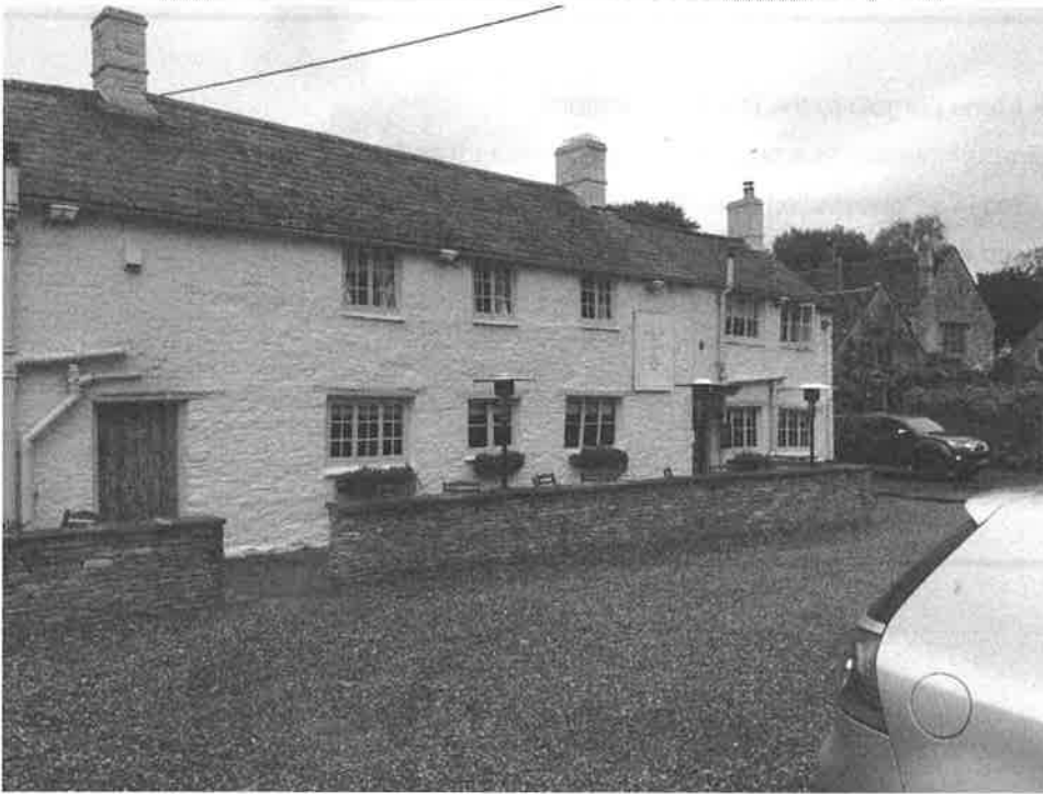
View looking due north west existing terrace and main entrance into public house.