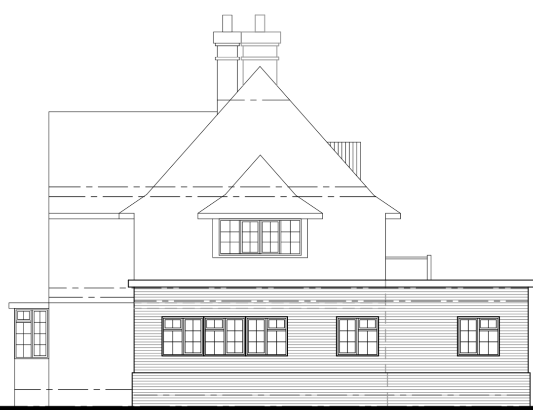
FLANK ELEVATION (1:100 SCALE)

lead effect flat roof black upvc gutters and downpipes to match existing white upvc double glazed windows and doors to match existing face brickwork to match existing