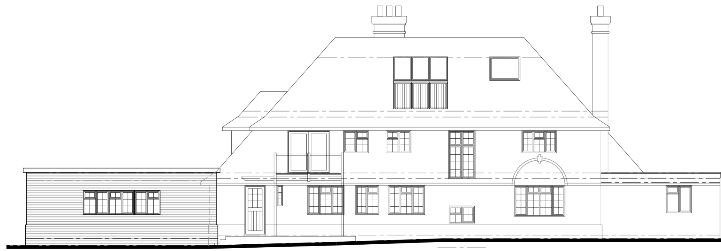
REAR ELEVATION (1:100 SCALE)

lead effect flat roof black upvc gutters and downpipes to match existing white upvc double glazed windows and doors to match existing face brickwork to match existing