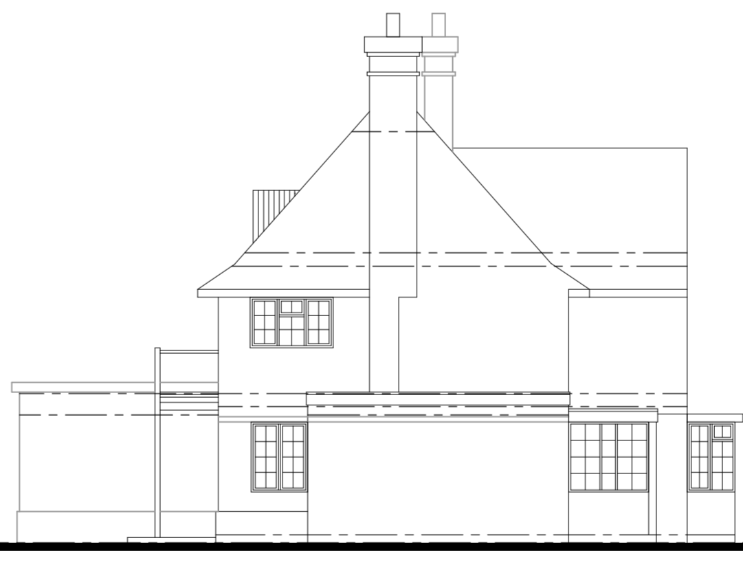
FLANK ELEVATION (1:100 SCALE)

Copyright © 2009 JaGs ArchiTechs. All rights reserved. Limited reproduction and distribution permitted for the sole purpose of the construction of this named development only. Do not scale - refer to figured dimensions only.