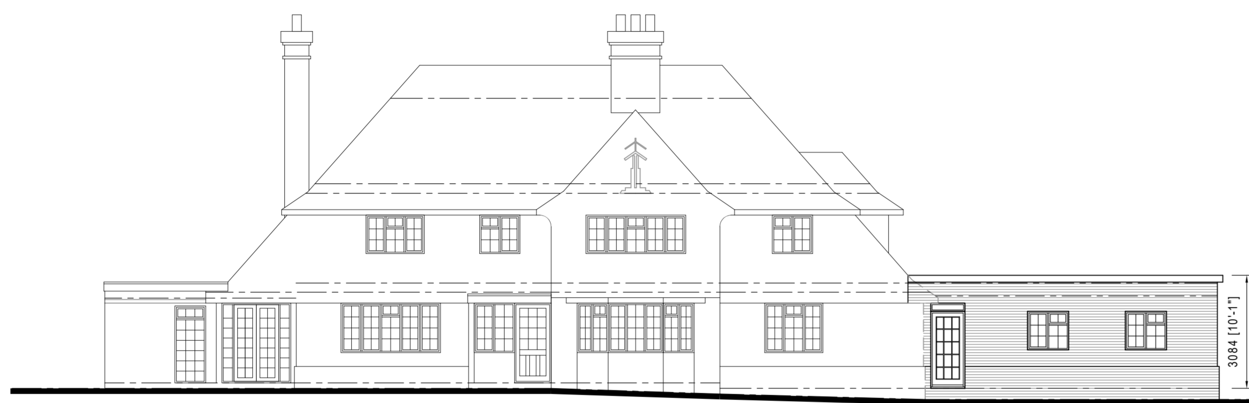
FRONT ELEVATION (1:100 SCALE)