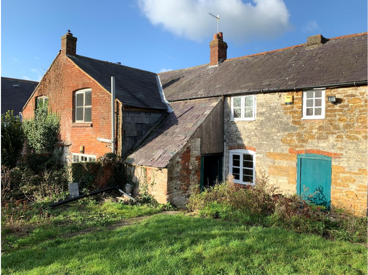
Image A.3 – Alternative view showing dilapidated existing rear extension to be removed. Proposed rear extension to be constructed in brickwork to match that of adjoining dwelling and brickwork detailing.