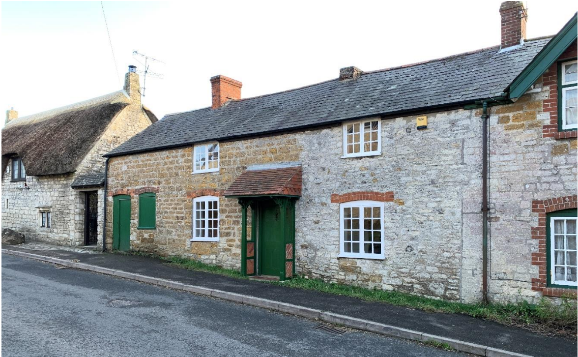
Image A.1 – View looking towards north elevation. The proposals detailed under this application are not visible from or cause any modification to the front elevation.