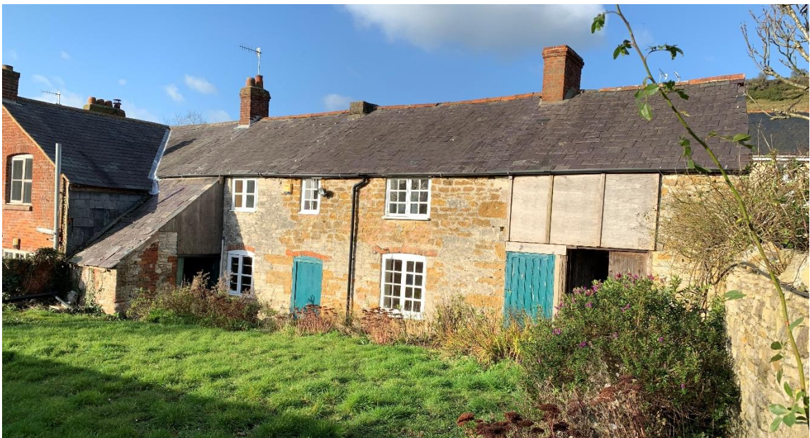
Image A.2 – View looking towards south elevation showing location of proposed alterations and extension. Existing doors to store to be replaced with door and window and weatherboarding to replace existing timber sheet at high level.