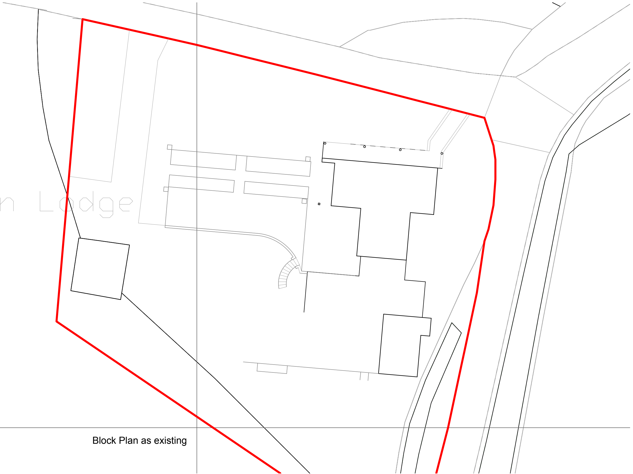
Block Plan as existing