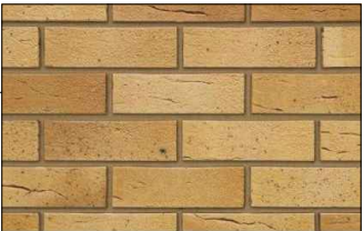
Surrey yellow mixed stock brick by Ibstock