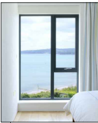
Grey Aluminium Frame Window by Sapa Building System