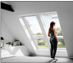
Velux top hung rooflight