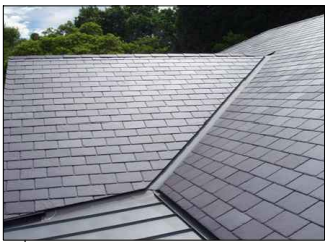
Grey Slate tile by The natural Slate co.