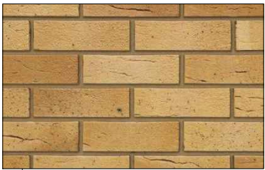
Surrey yellow mixed stock brick by Ibstock