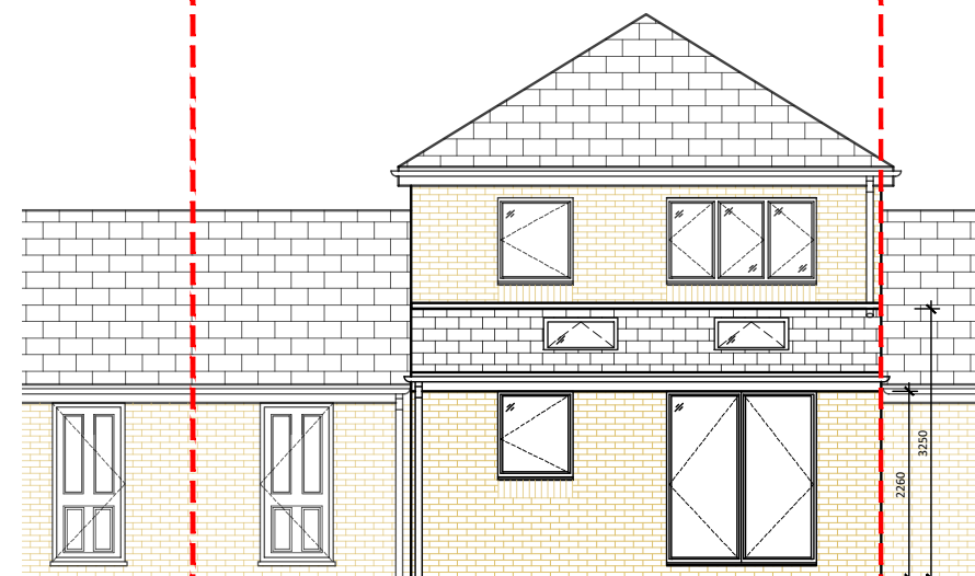
PROPOSED REAR ELEVATION Scale 1:100 @A3