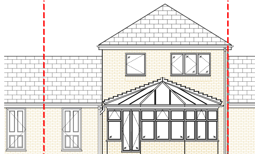
EXISTING REAR ELEVATION Scale 1:100 @A3