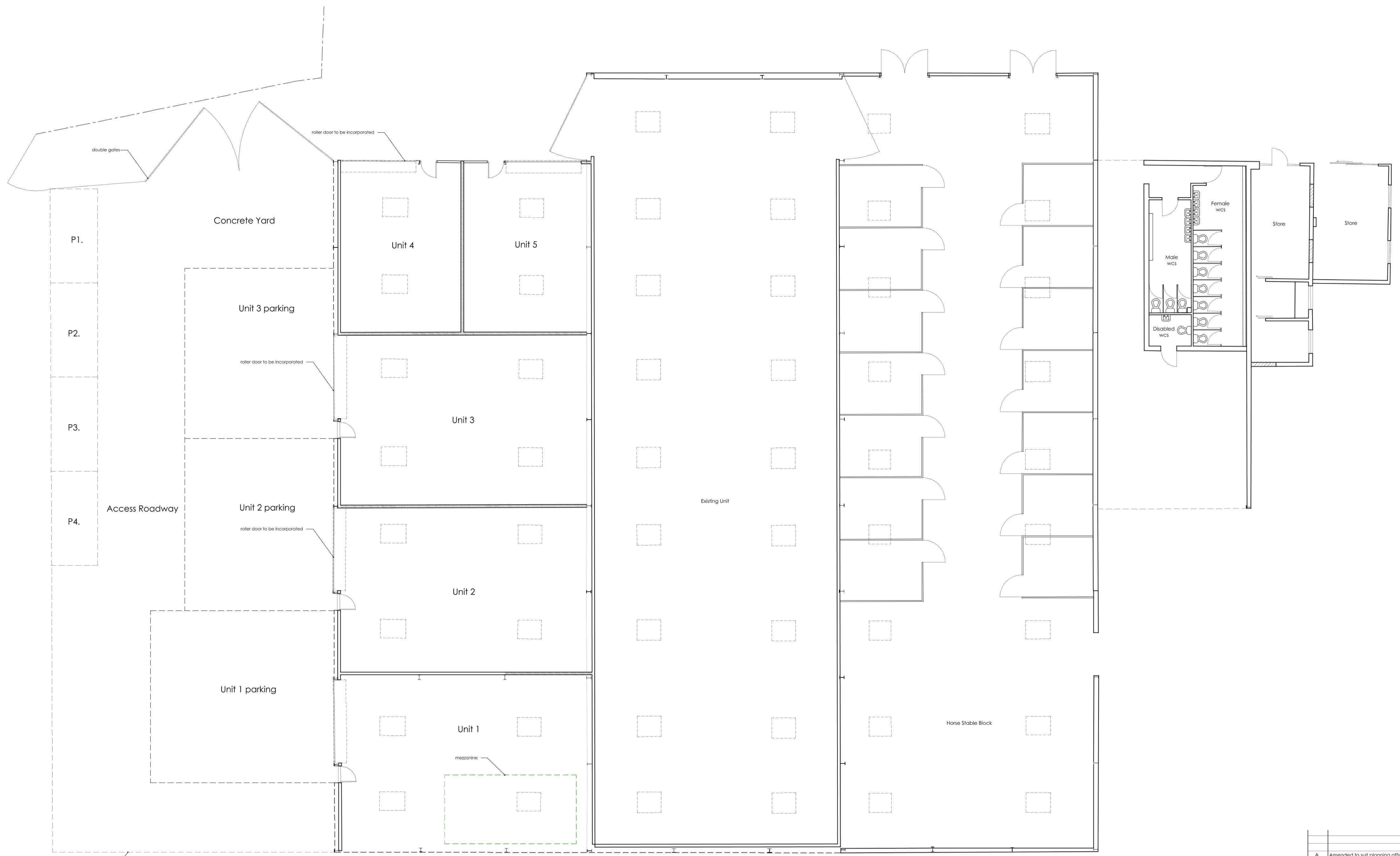
Ground Floor Scale: 1:100

Notes: All Dimensions must be checked on site and any discrepancies reported to the designer before any work commences. DO NOT SCALE from this drawing. This drawing is copyright of fisher & associates ltd. and may not be copied or printed without express written permission from fisher & associates ltd.