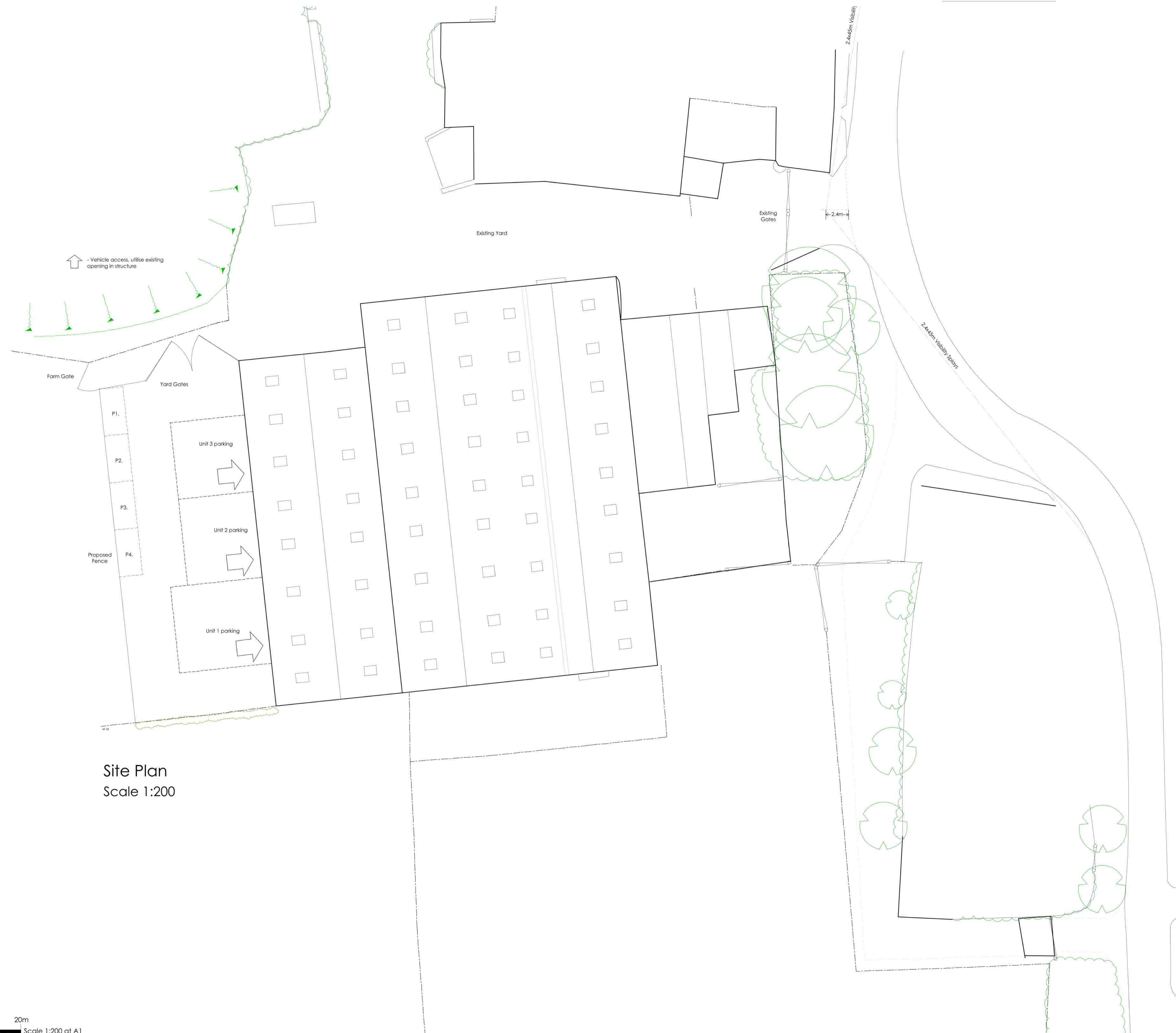
Site Plan Scale 1:200

Notes: All Dimensions must be checked on site and any discrepancies reported to the designer before any work commences. DO NOT SCALE from this drawing. This drawing is copyright of fisher & associates ltd. and may not be copied or printed without express written permission from fisher & associates ltd.