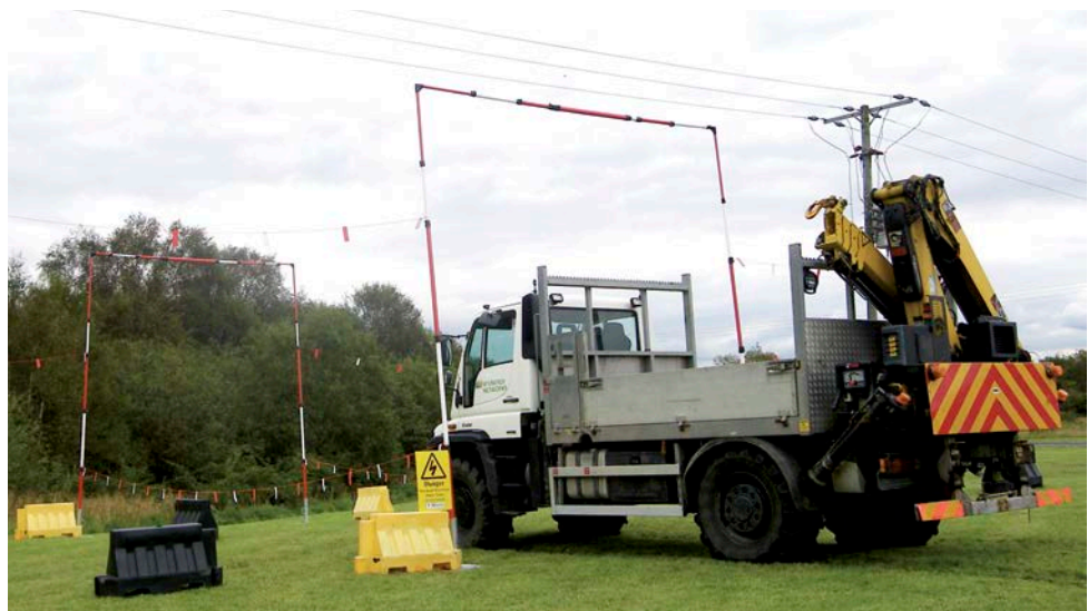
Figure 5 Typical passageway through barriers