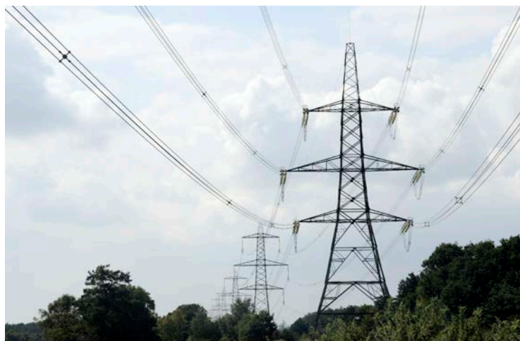
Figure 1 275 kV transmission line

6 Most overhead lines have wires supported on metal towers/pylons or wooden poles – they are often called ‘transmission lines’ or ‘distribution lines’. Some examples are shown in Figures 1–3.