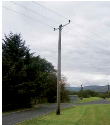
Figure 2 11 kV distribution line