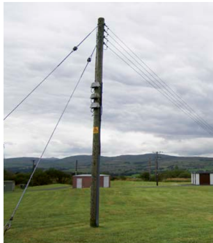
Figure 3 400 V distribution line

7 Most high-voltage overhead lines, ie greater than 1000 V (1000 V = 1 kV) have wires that are bare and uninsulated but some have wires with a light plastic covering or coating. All high-voltage lines should be treated as though they are uninsulated. While many low-voltage overhead lines (ie less than 1 kV) have bare uninsulated wires, some have wires covered with insulating material. However, this insulation can sometimes be in poor condition or, with some older lines, it may not act as effective insulation; in these cases you should treat the line in the same way as an uninsulated line. If in any doubt, you should take a precautionary approach and consult the owner of the line.