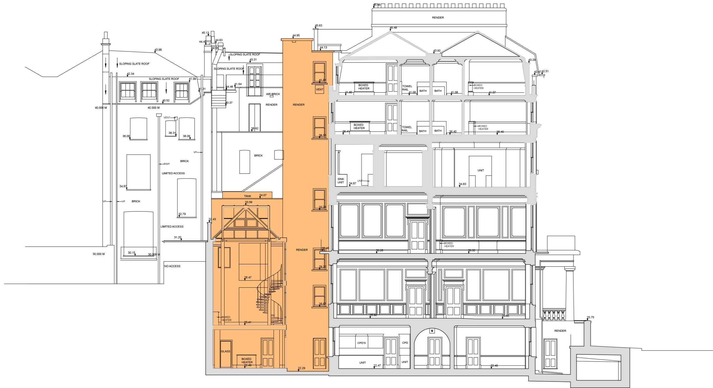
1 EXISTING SECTION A-A SCALE: 1:70