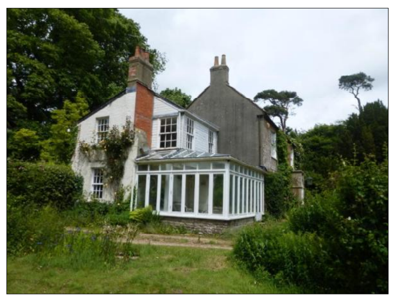
Fig.2 The South-West elevation showing the original gable (now rendered) end of the house, the extension of the rear range and the 20<sup>th</sup> century conservatory and timber first floor extension.

In January 1992 a planning application was approved for a replacement of an existing greenhouse with the current conservatory. This was constructed against the front wall of this wing under a jettied and sash-windowed timber extension to the bedroom above (Figure 2). This conservatory has internal access from the two abutting rooms.