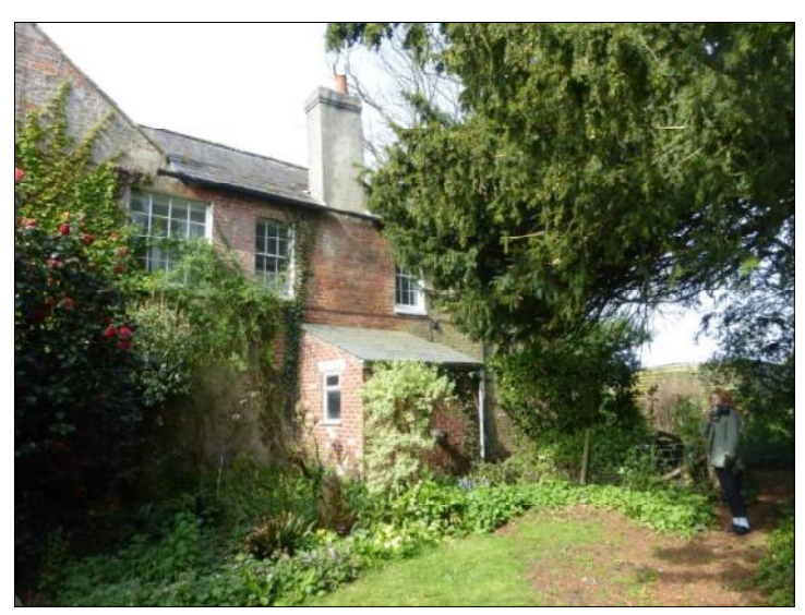
Fig.4 The rear wing with the sash window (left) which originally served the third bedroom. The other windows are later insertions.

2.2 The original plan of the house (Figure 3) consisted on both floors of a principal room placed on either side of a wide entrance hall containing the main stair rising away from the front door. An original service wing extends from the northern corner of the house; this is constructed of the same brickwork as the main range and contains the same sash windows (Figure 4). Behind the main range is a parallel narrower range. This is a later addition and was subsequently extended with the narrow wing described above in para 2.1.