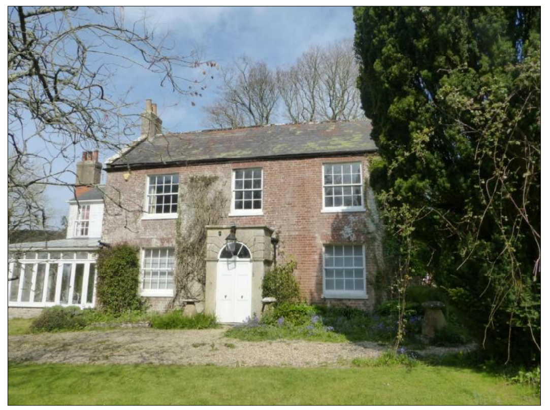
Fig.1 Kingsland House: Front elevation.

Peter Child MA (Cantab), Dip Conservation Studies (York), IHBC