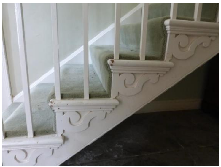
Fig.7 Scrolled stair tread ends.