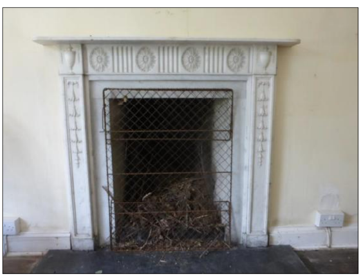
Fig.6 Drawing room fire surround.

2.7 The staircase is elegant with stick balusters, scrolled tread ends (Figure 7) and a wreathed terminal. There are substantial panelled doors to the principal rooms. Of lesser significance but which are interesting survivals, are the servants bells in the kitchen (and the pulleys for them in the attic) and the iron baking oven, with its unusual removable lining, set in the kitchen wall to the left of the fireplace.