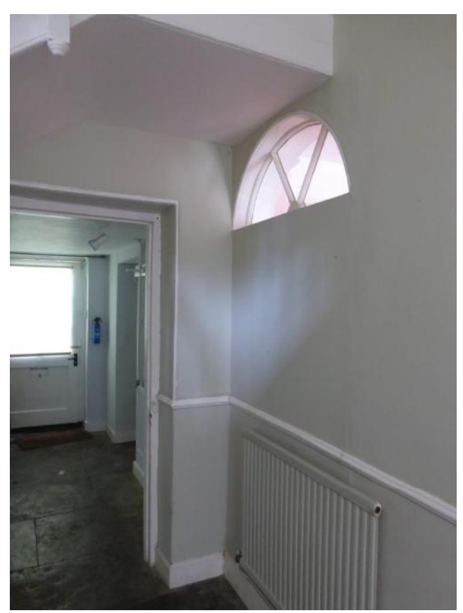
Fig.5 Fanlight over the blocked original doorway into the rear service wing.