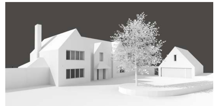
Proposed model images