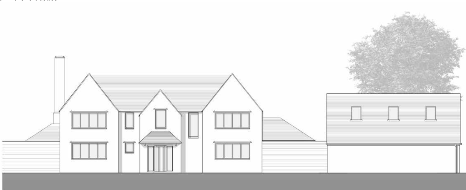
Proposed SE elevation

The existing garage will also be taken down and rebuilt off the existing foundations. The footprint of the garage will be extended to the NE to provide additional workshop space, and the pitch of the roof increased, to match the house, and provide ancillary accommodation within the loft space.