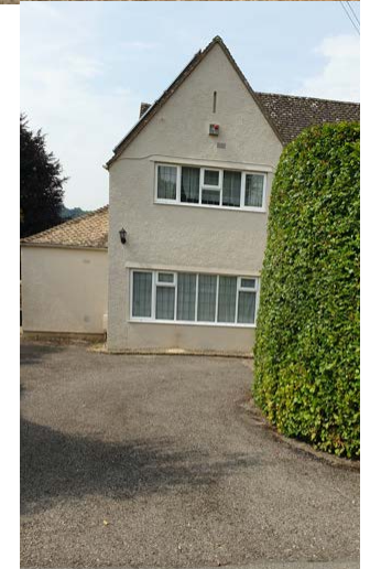
Images of the existing property