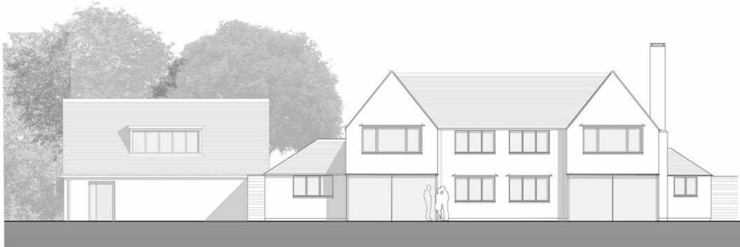
Proposed NW Elevation

There will be a level threshold to the front door, the permeable SUDs driveway will extend to a paved surface adjacent to the front door to provide easy access for wheel chairs and the property will have an accessible WC at ground floor level.