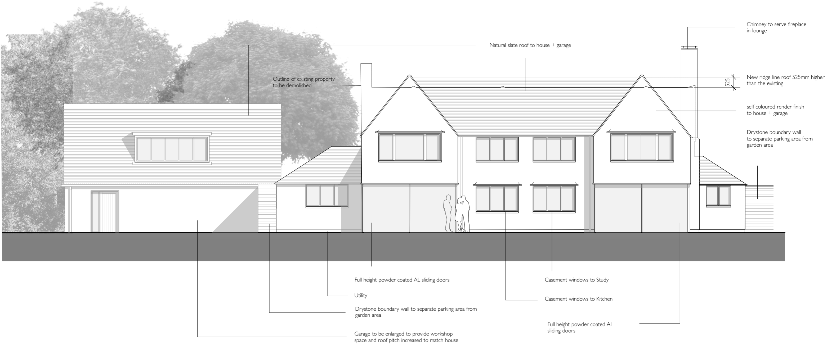
1 Proposed NW Elevation 155-12-2 Scale 1:100 @ A2