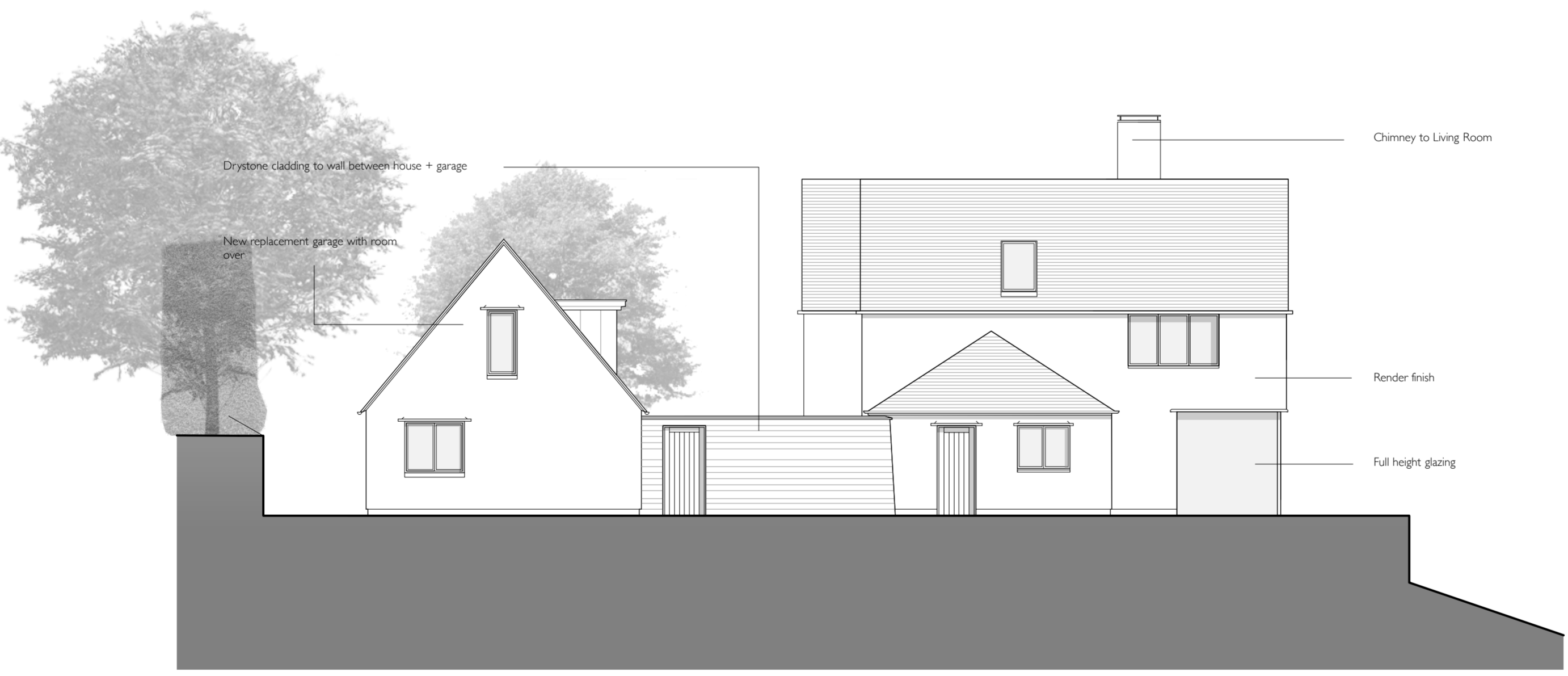
2 155-13-2 Proposed SE Elevation Scale 1:100 @ A2