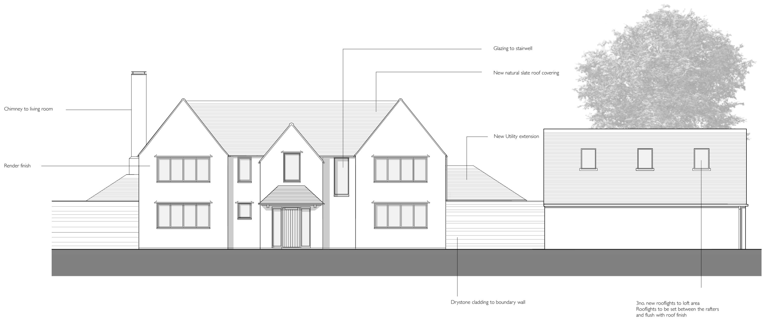
1 155-13-2 Proposed NE Elevation Scale 1:100 @ A2