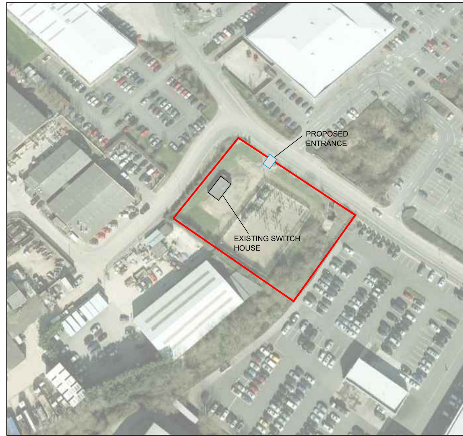
AERIAL VIEW NOT TO SCALE