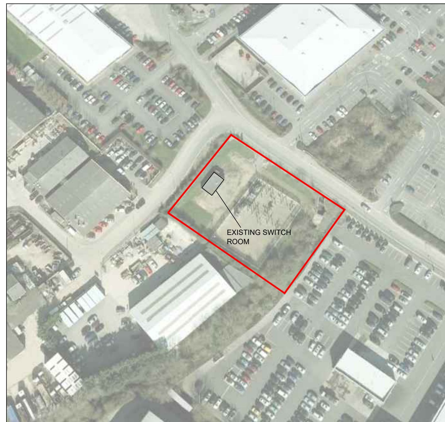
AERIAL VIEW NOT TO SCALE