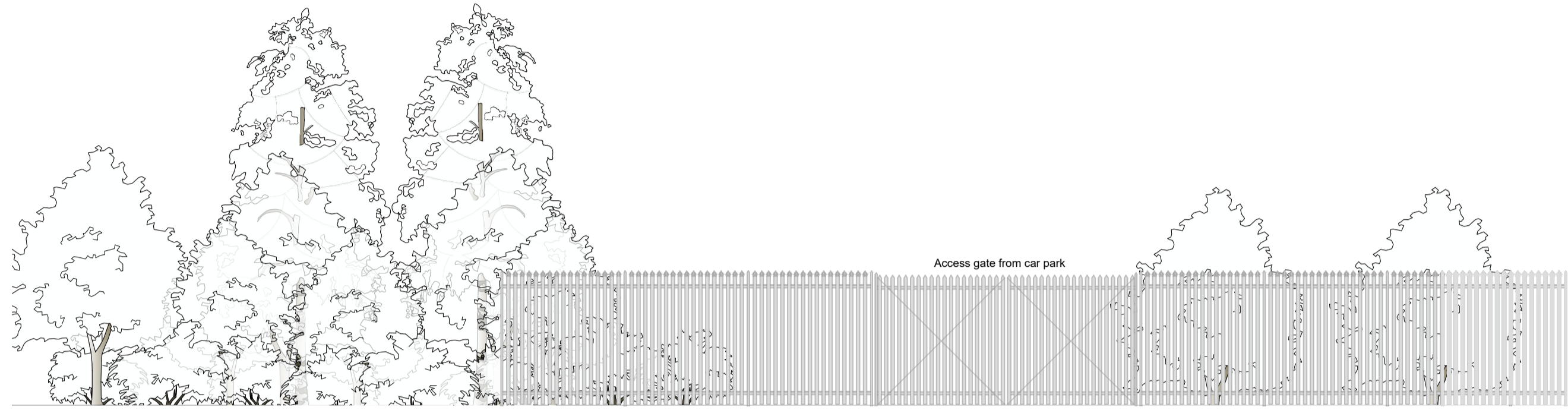
EXISTING ELEVATION FROM CAR PARK SCALE 1:100