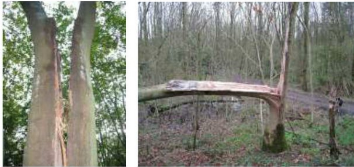
Failed ash tree with two codominant stems.

However, the presence of included bark does not mean the tree will fail. Codominant stems are a common feature of many trees and most will live to the end of their natural life without a problem. The decision whether to take remedial action should take a range of factors into consideration including the size, position and condition of the tree and the proximity of 'targets' close to the tree.