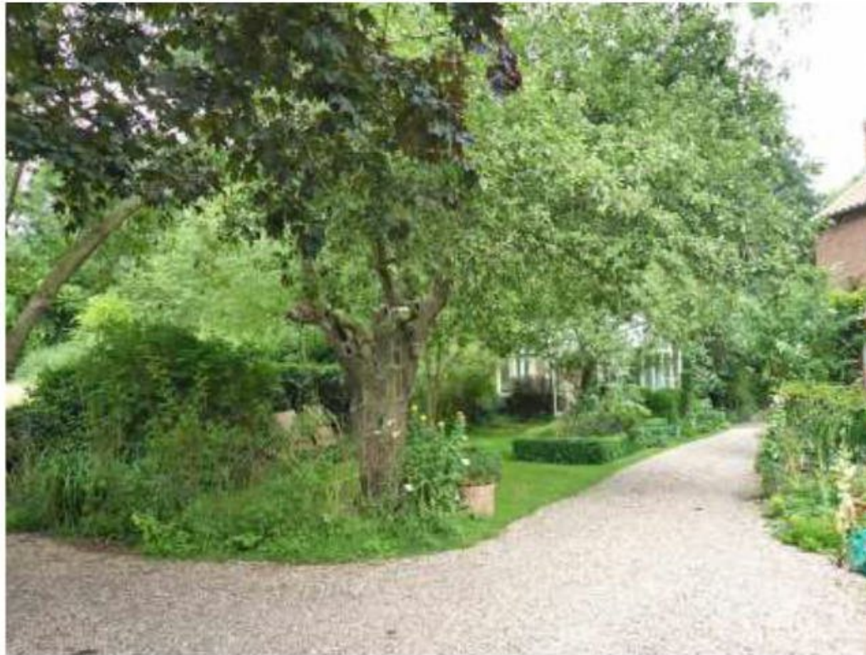
The garden of Woodland Cottage looking north.

To the south of the woodland, the cottage has mature gardens with fruit trees and semi-ornamental planting.