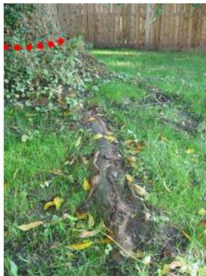
Figure 2. Ash roots damaged by 'landscaping'