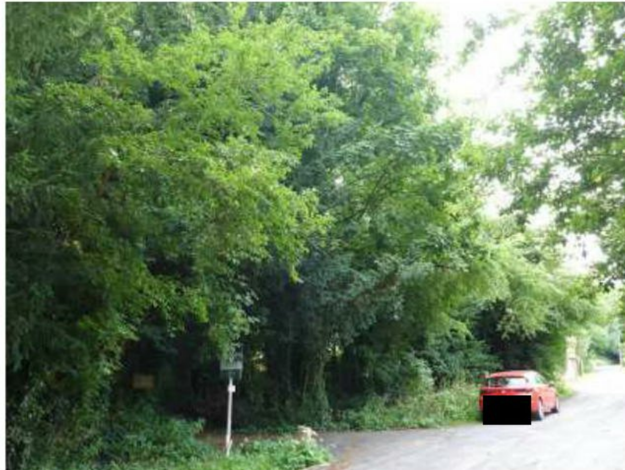
The frontage to Westhorpe looking west.

The survey site is a woodland plot to the south of Westhorpe including Woodland Cottage. It is believed that the woodland area used to be an orchard with pig sties but there are only a few dead remnants of apple trees and the remains of some brickwork. Today, the wood mainly consists self-set sycamore with the occasional ash, cherry or goat willow. In competition for light the trees have an etiolated form with a high, closed canopy and no understorey other than ground elder, ivy and a few nettles. Several of the trees have codominant stems with significant included bark (see Appendix D ).