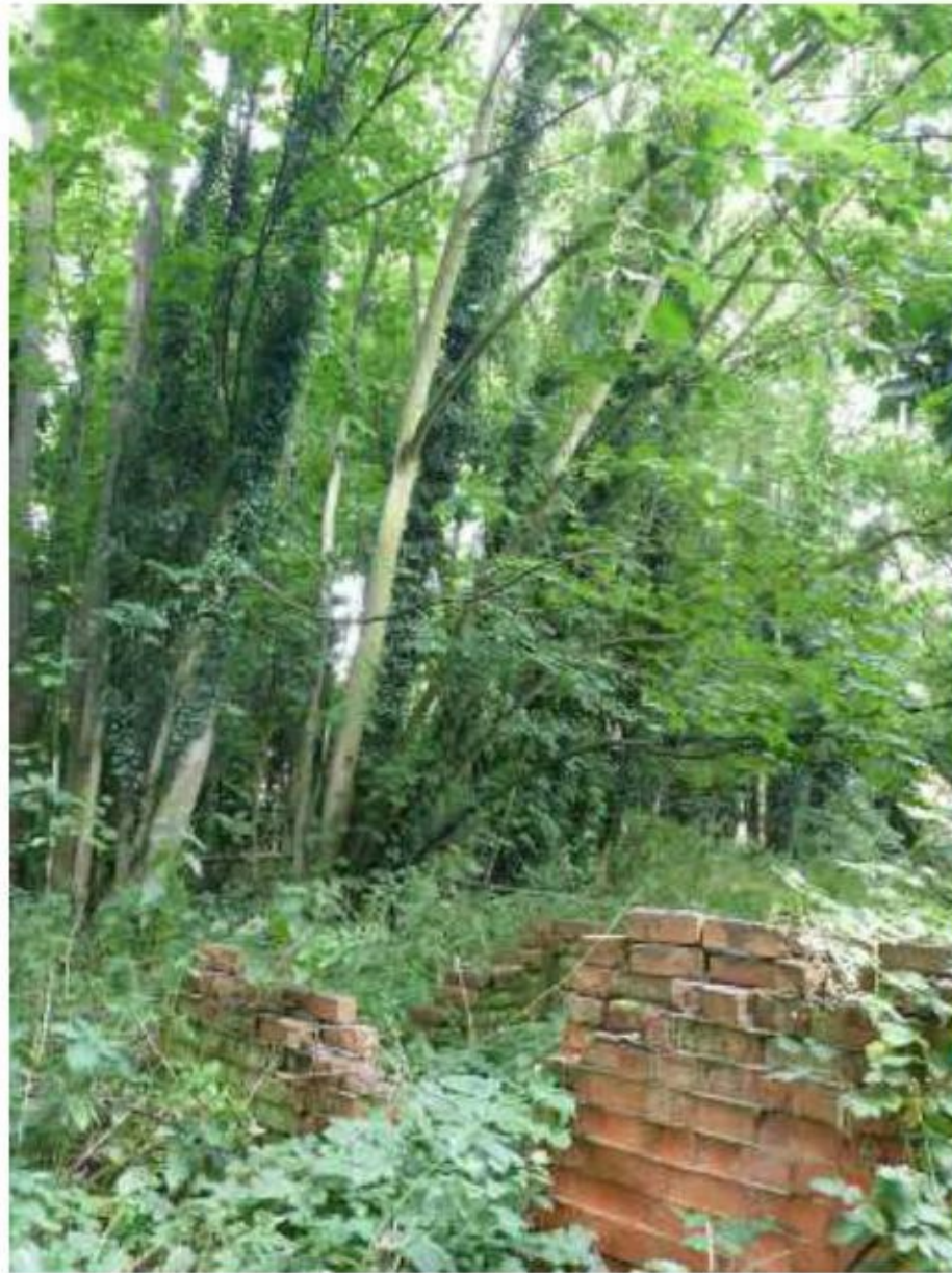
Tall, spindly stems and ground elder growing over remains of brickwork.