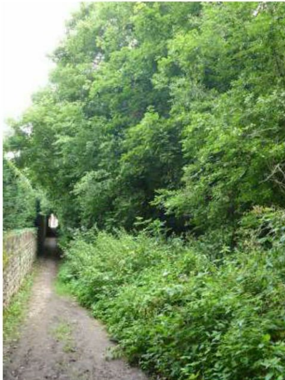
View looking north along the footpath running to the west of the woodland plot.