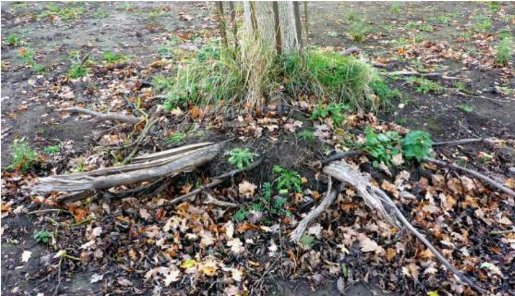
Figure 3. Walnut roots smashed by an excavator.