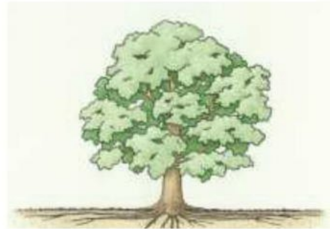
Figure 1. Trees have relatively shallow but wide spreading roots

Figure 2 and Figure 3 show root damage from 'landscaping'. Using a mechanical digger, 30-40 centimetres of soil was removed from the original level (marked in red).