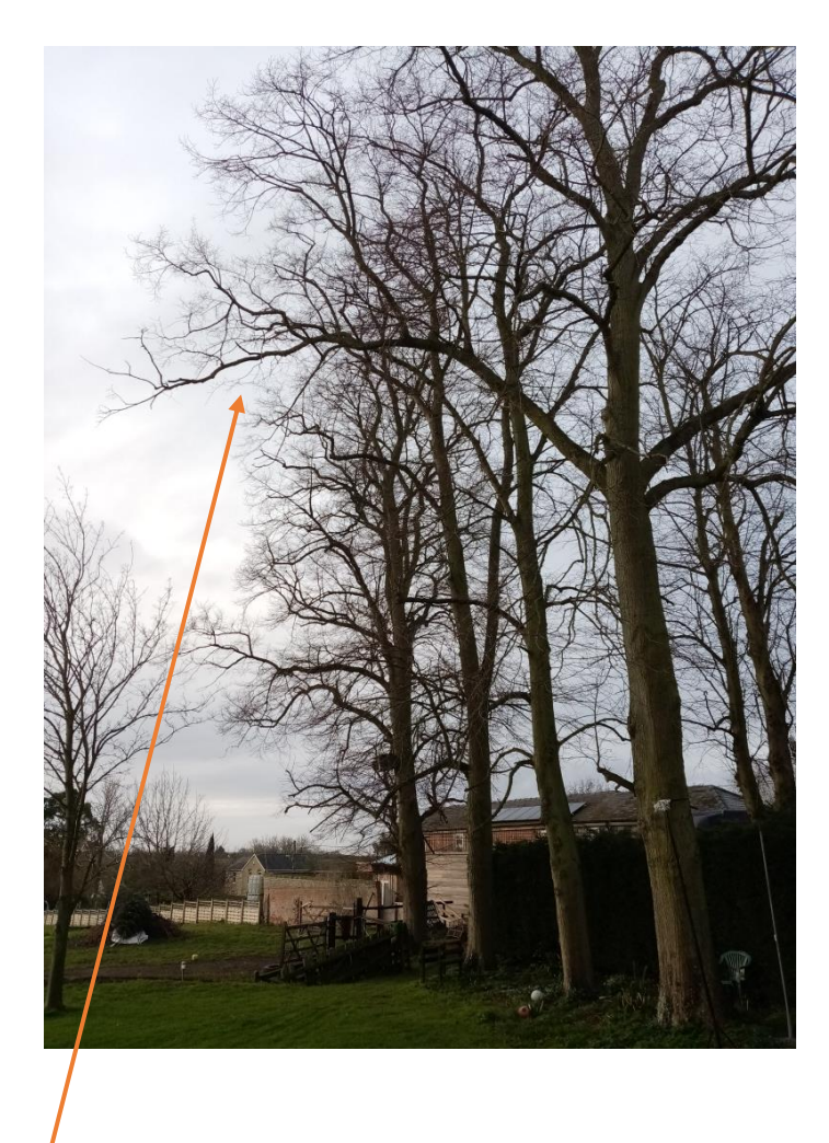
Cut back branch