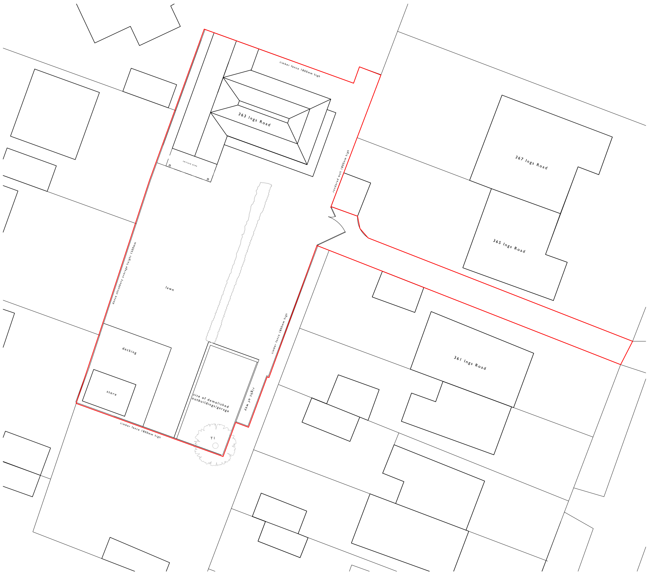
SITE / ROOF PLAN AS EXISTING - SCALE 1:250

INGLEBY & HOBSON ARCHITECTS LTD FIRST FLOOR 28 LAIRGATE BEVERLEY EAST YORKSHIRE TEL: 01482 868690 EMAIL: inghob@gmail.com