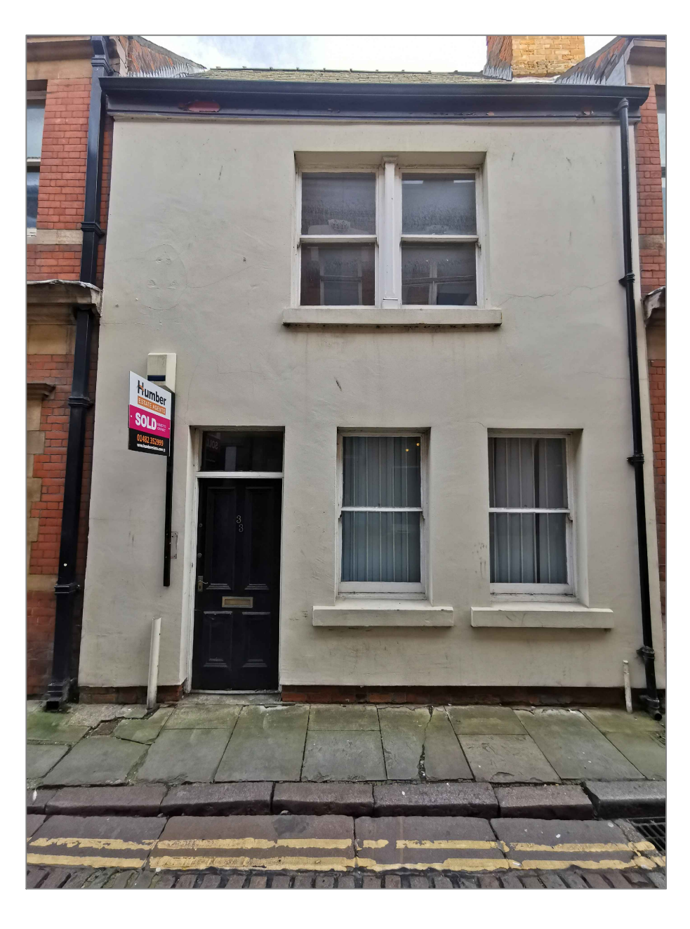
33 BISHOP LANE FRONT ELEVATION - EXISTING