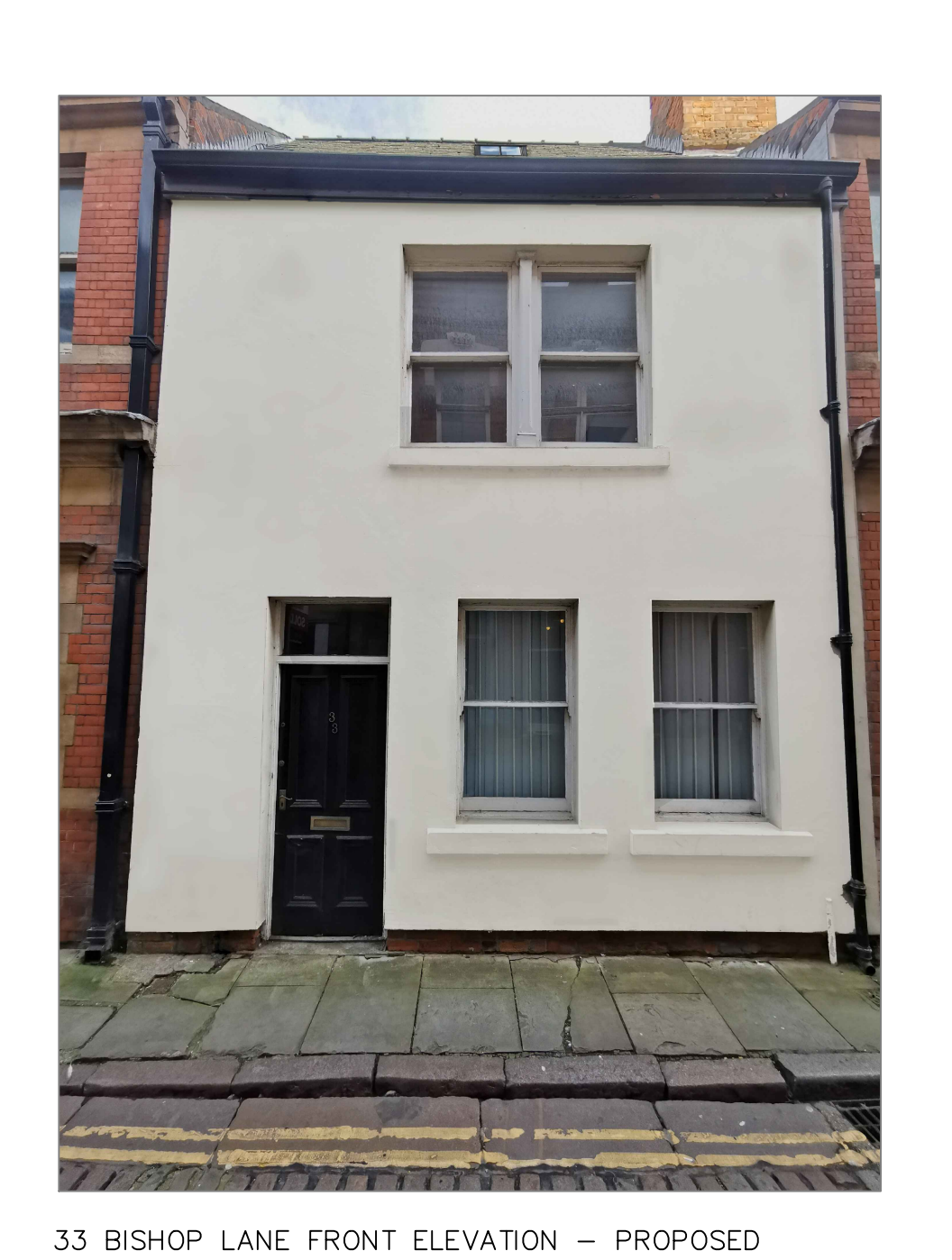
[ITEM A - CONSERVATION VELUX TO ROOF SHOWN]