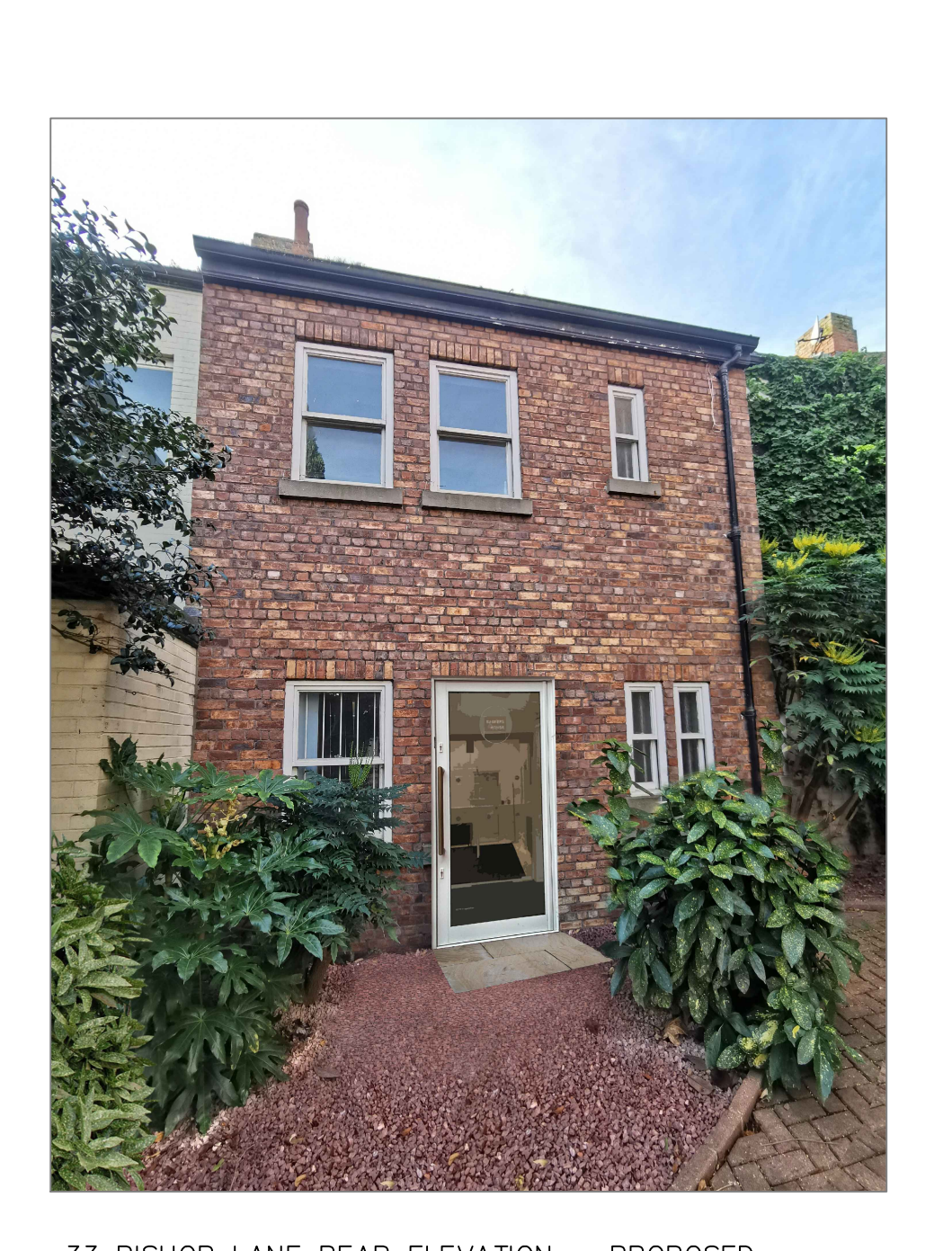
33 BISHOP LANE REAR ELEVATION - PROPOSED [ITEM C - REAR DOOR SHOWN]