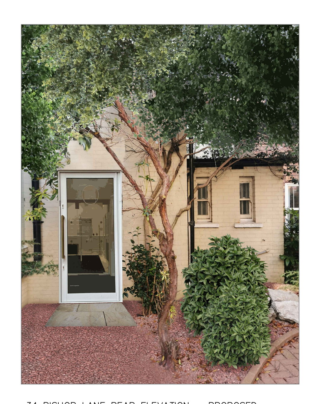
34 BISHOP LANE REAR ELEVATION - PROPOSED [ITEM B - REAR DOOR SHOWN]