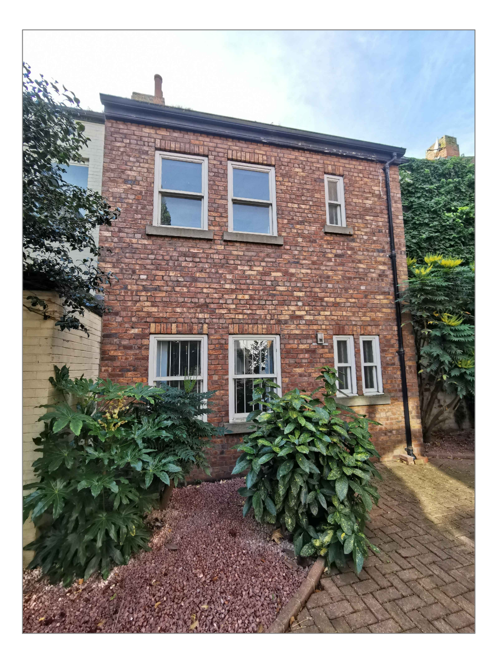
33 BISHOP LANE REAR ELEVATION - EXISTING