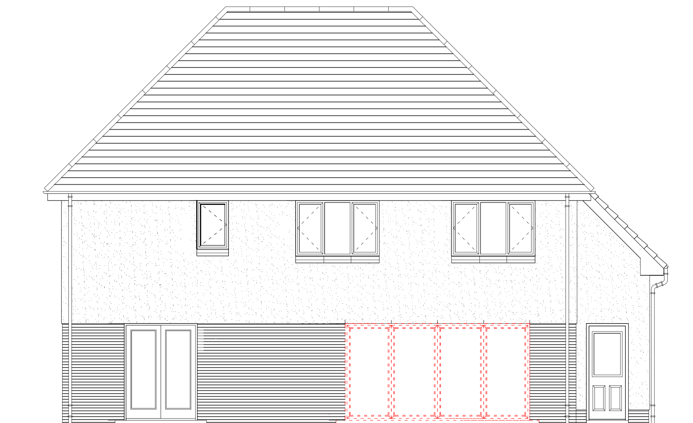
EXISTING SOUTH ELEVATION scale 1:50