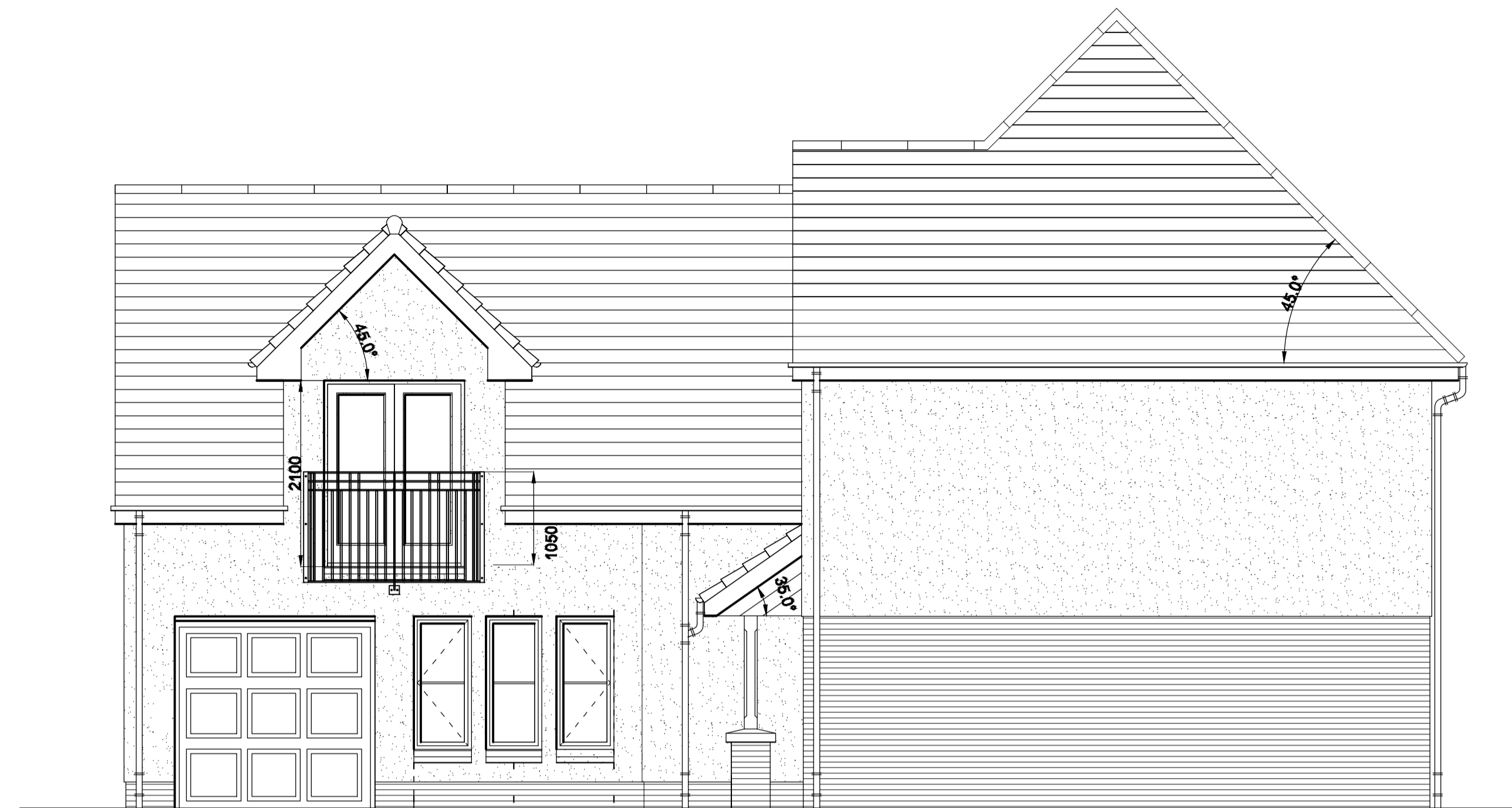
EXISTING WEST ELEVATION scale 1:50