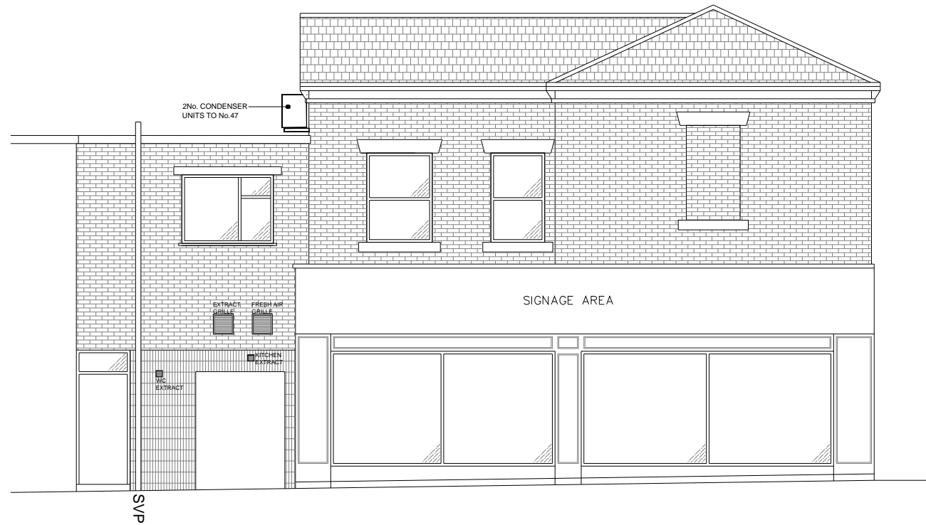
EXISTING SIDE ELEVATION EAST