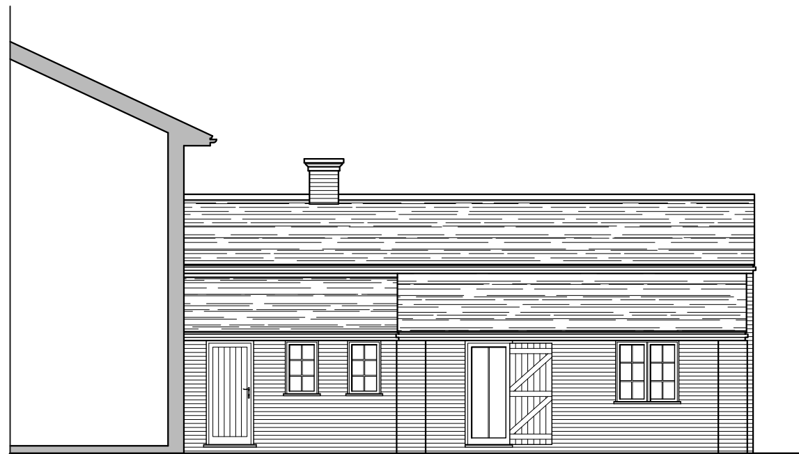
Proposed North Elevation - 1:100