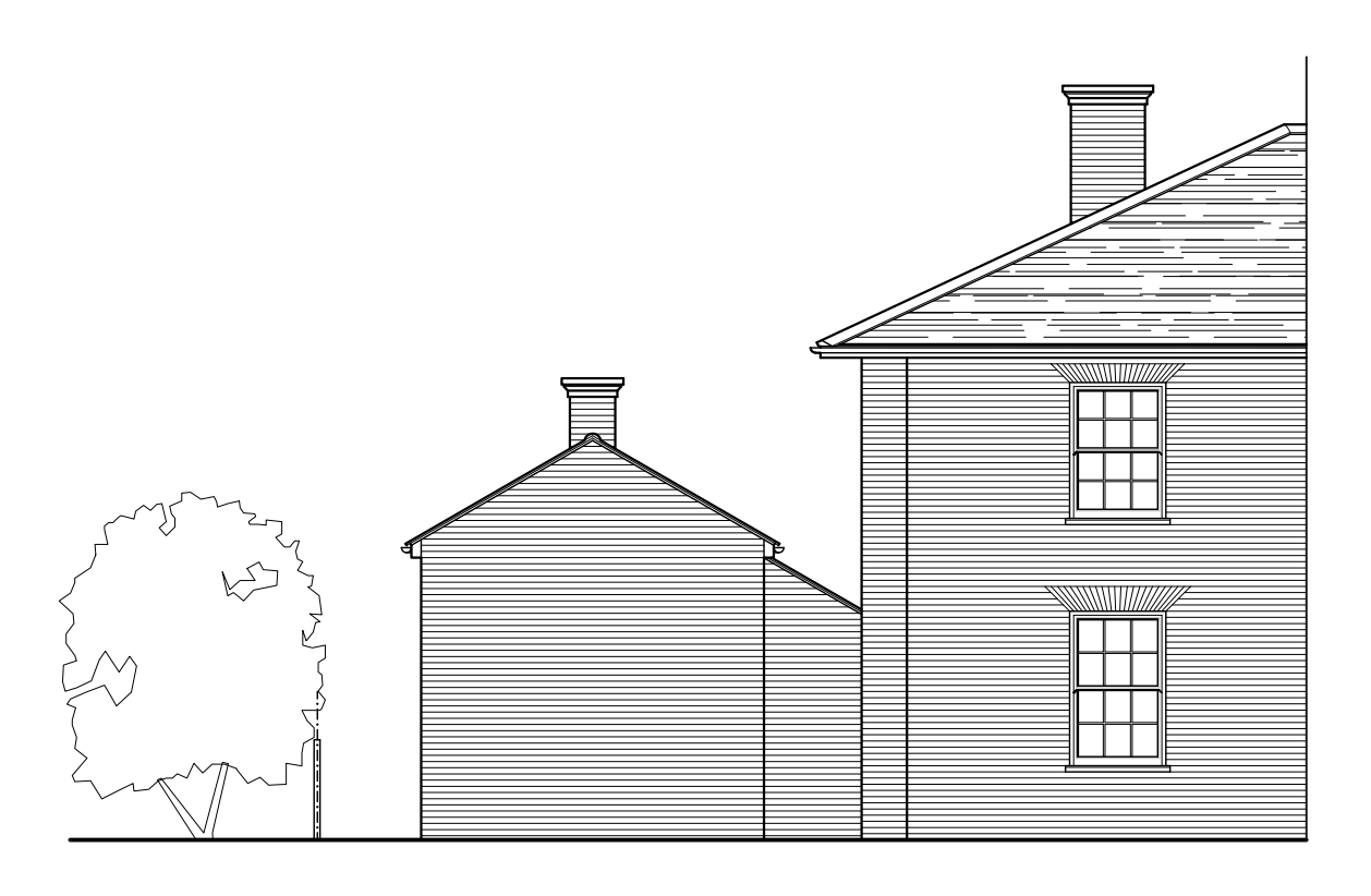
Existing East Elevation - 1:100