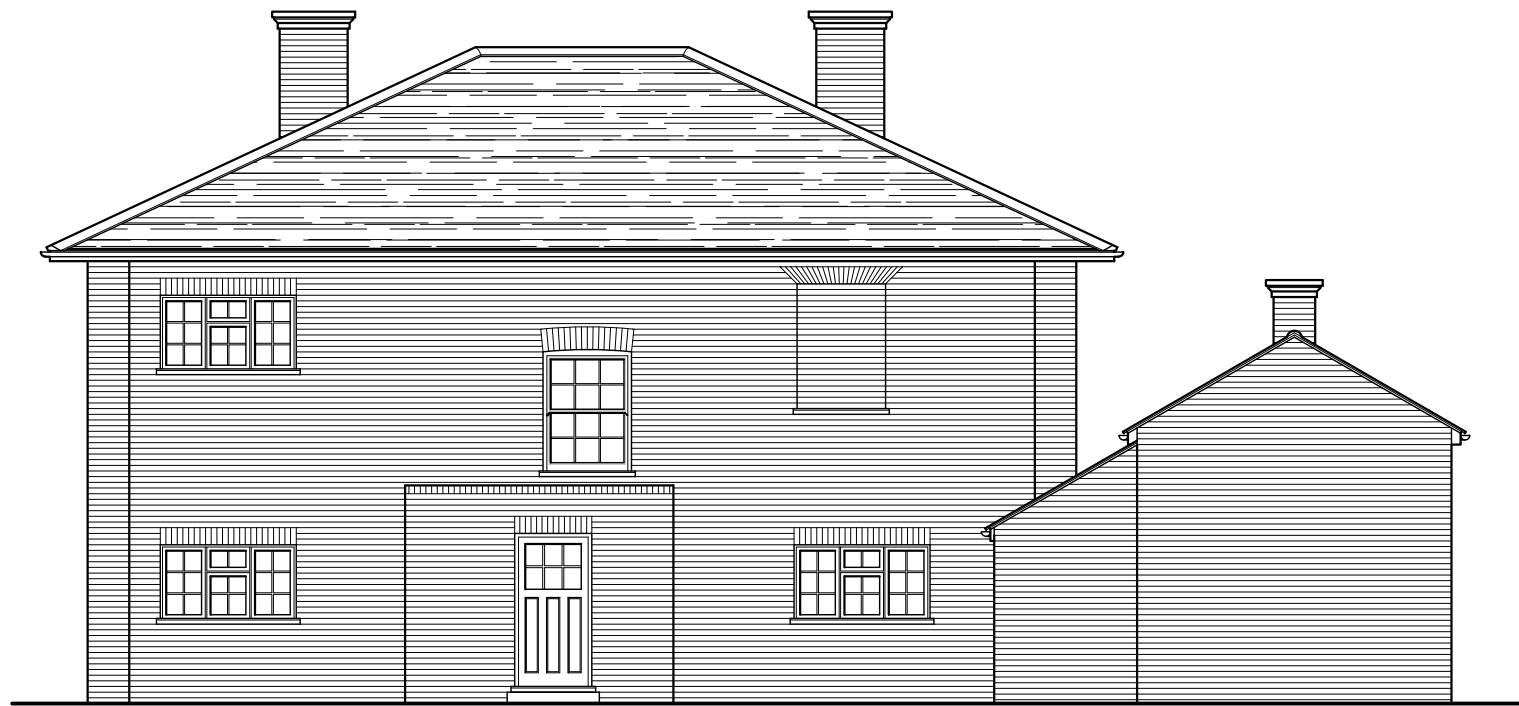
Existing West Elevation - 1:100