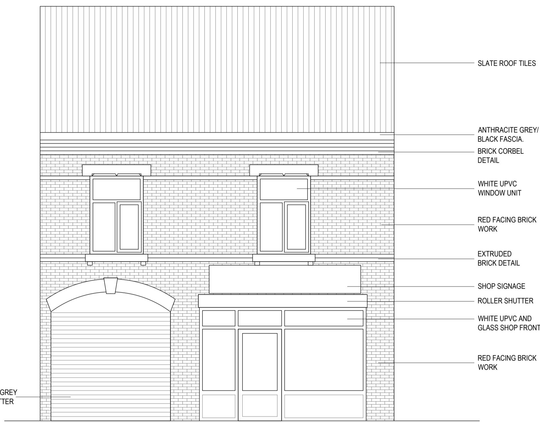
PROPOSED FRONT ELEVATION SCALE 1/50