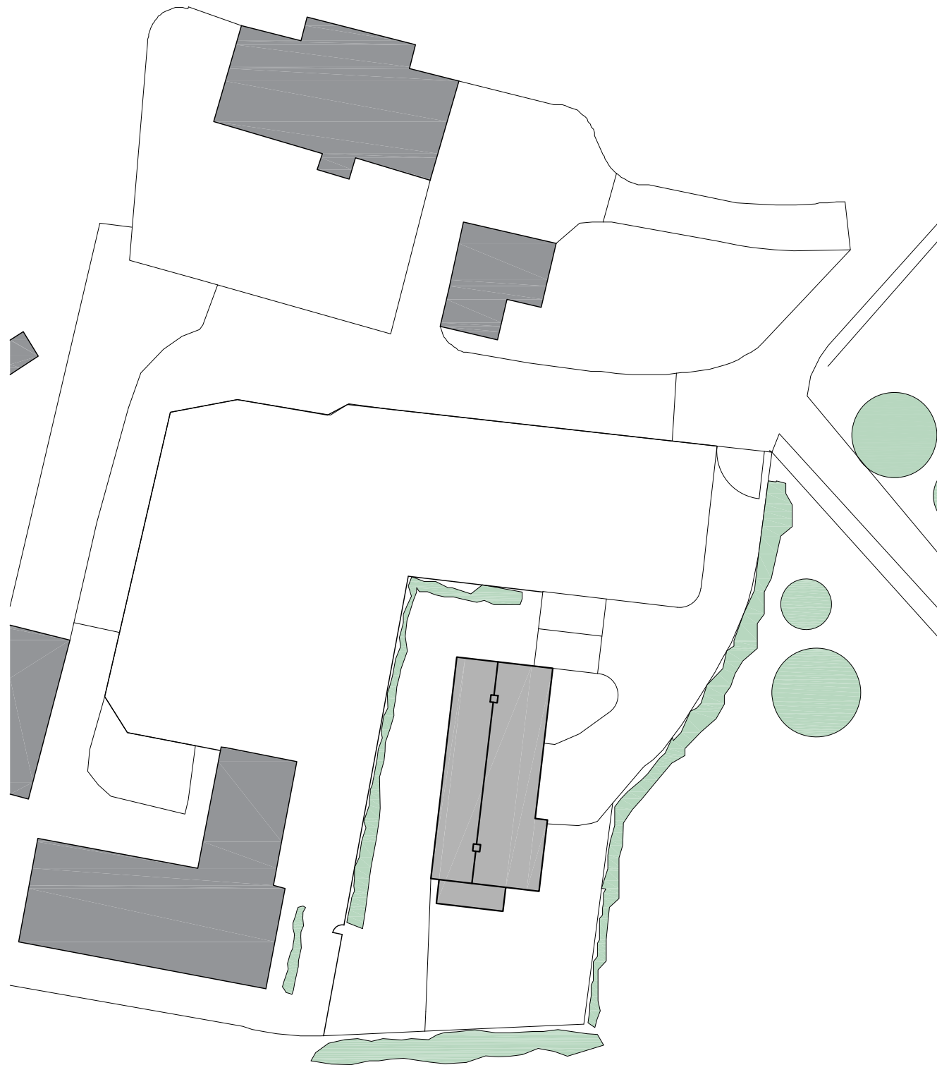
Proposed Site Plan Scale 1:500

Use only noted dimensions and check all measurements on site before proceeding with the works. Any queries regarding areas, levels or dimensions must be referred back to BBR Design Services Ltd. All dimensions of existing buildings to be verified on site.