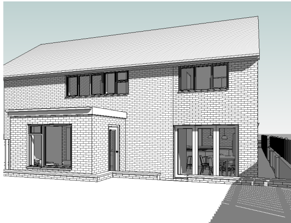
3 PROPOSED 3D View - REAR ELEVATION 1