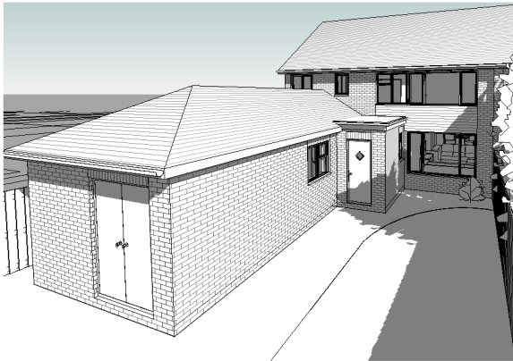
2 PROPOSED 3D View - FRONT ELEVATION