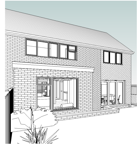
1 PROPOSED 3D VIEW - REAR ELEVATION 2