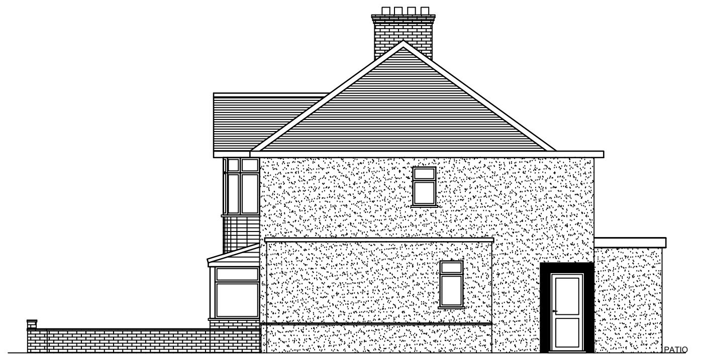
SIDE ELEVATION PROPOSED (AS VIEWED FROM WOODSIDE CLOSE ROAD.)