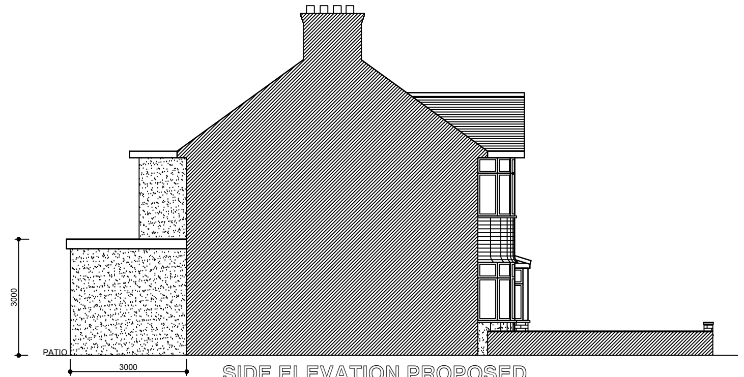
SIDE ELEVATION PROPOSED (AS VIEWED FROM NO.13)

ICREATE © DESIGN LIMITED Planning & Designing of All Types of Building Works 13 ROBB ROAD, STANMORE, HA7 3SQ Tel: 07886759400 ; EM: ikreated@gmail.com