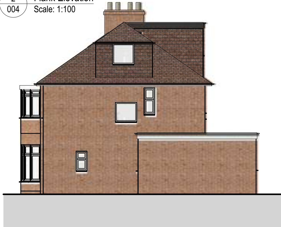
2 Flank Elevation 004 Scale: 1:100