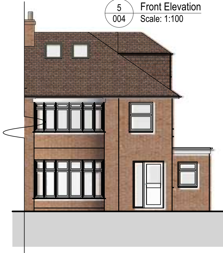
5 Front Elevation 004 Scale: 1:100