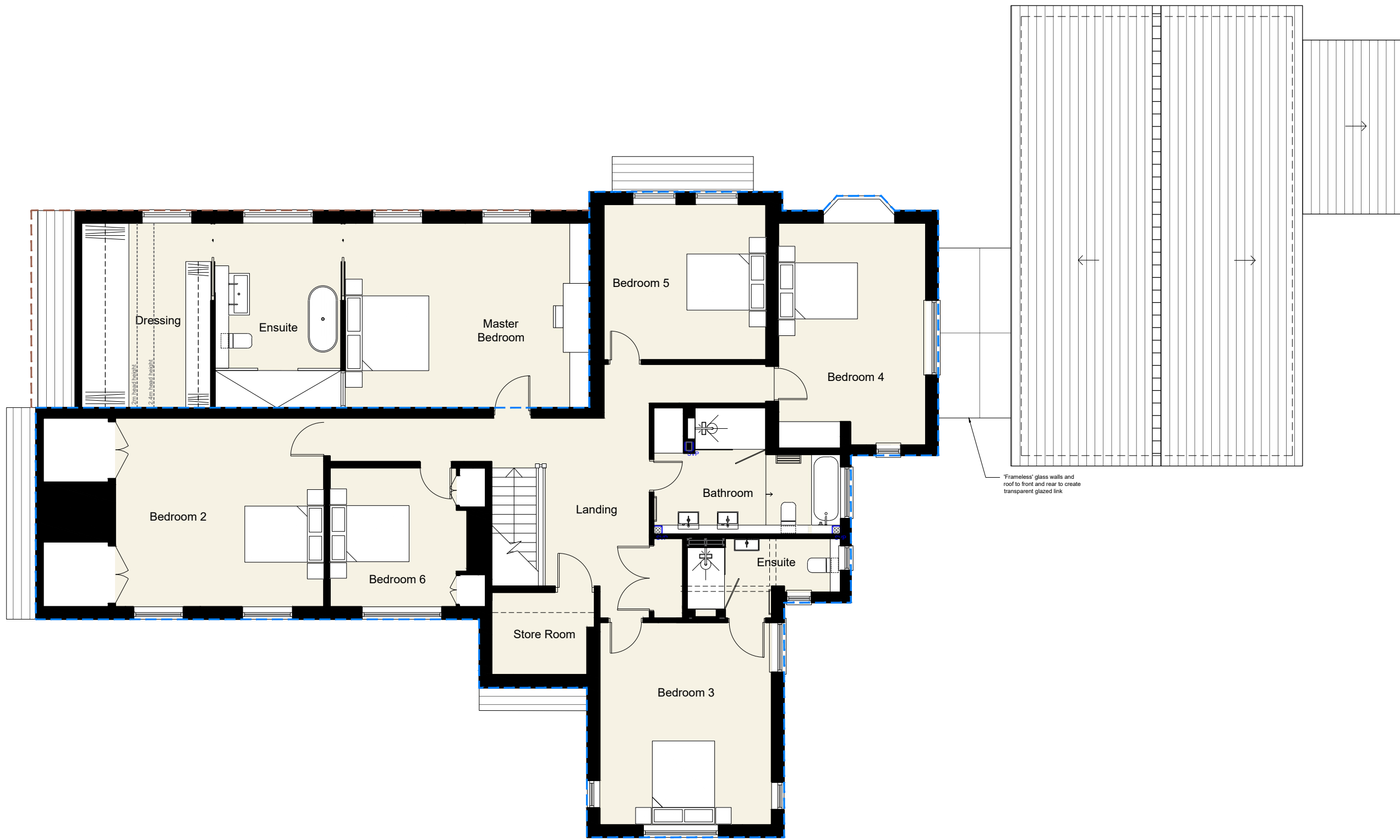
1 PLAN Proposed First Floor Plan SCALE 1: 100