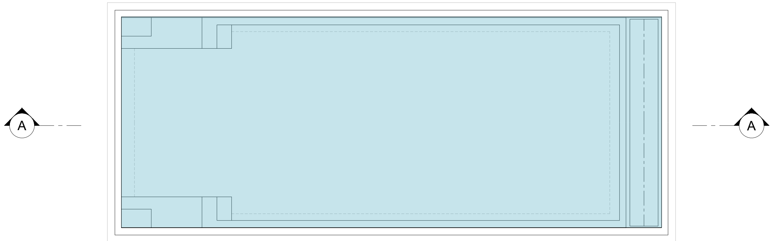
1 PLAN Proposed Swimming Pool Plan SCALE 1: 50