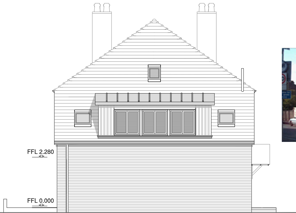
EXISTING Side Elevation . King Charles Crescent.