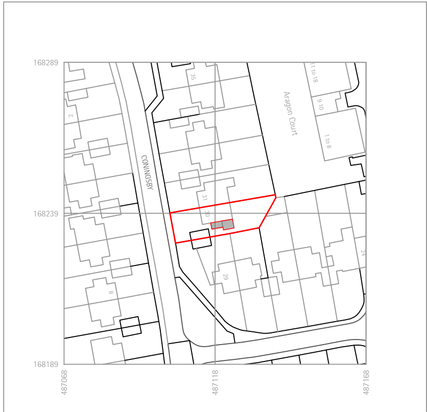
LP LOCATION PLAN SCALE 1:1250