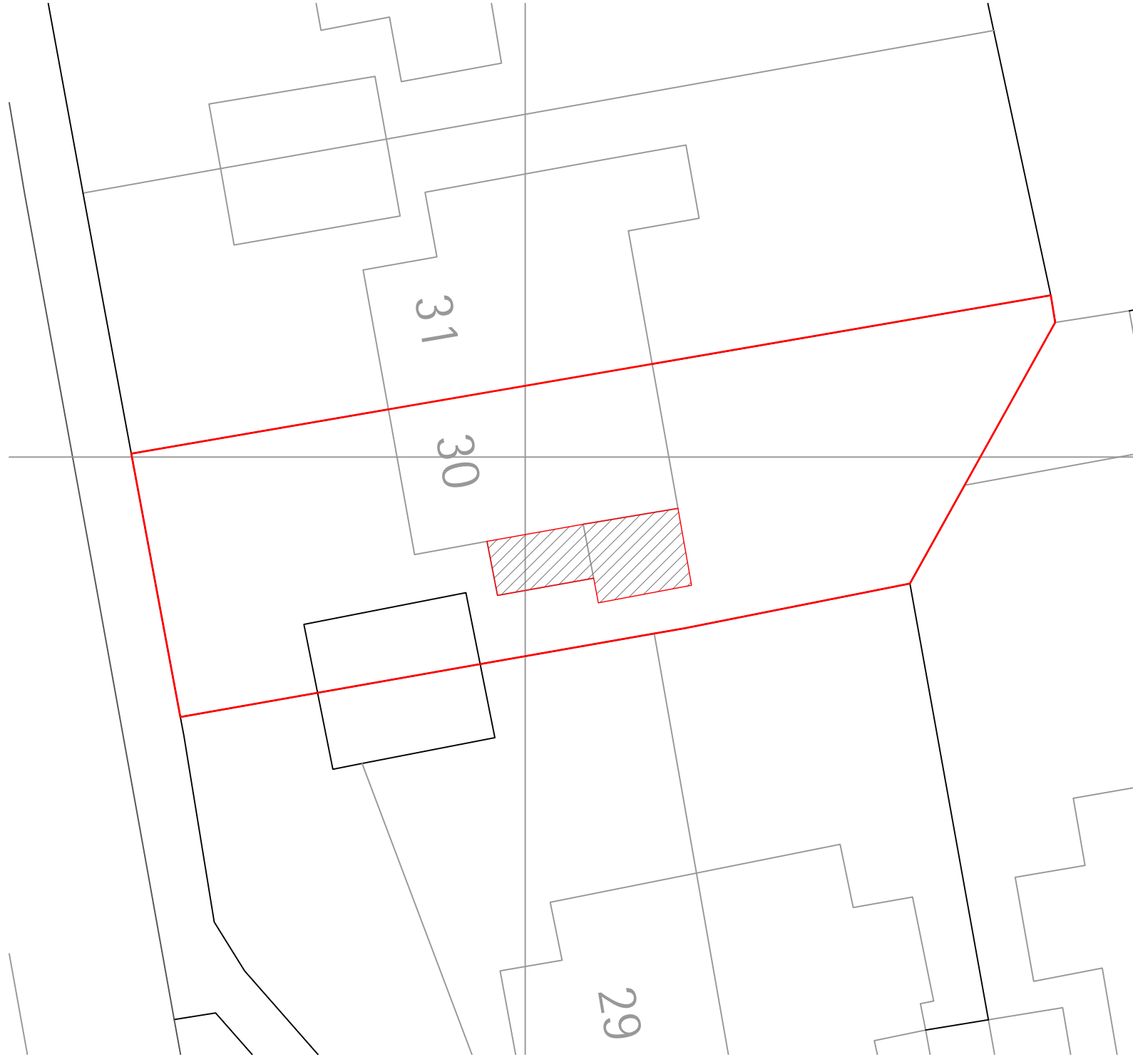
PR BLOCK PLAN SCALE 1:200

Produced on 30 August 2020 from the Ordnance Survey National Geographic Database and incorporating surveyed revision available at this date. This map shows the area bounded by 487068,168189 487068,168289 487168,168289 487168,168189 Reproduction in whole or part is prohibited without the prior permission of Ordnance Survey. Crown copyright 2020. Supplied by copla ltd trading as UKPlanningMaps.com a licensed Ordnance Survey partner (100054135). Data licenced for 1 year, expiring 30 August 2021. Unique plan reference: v1c/500622/678786