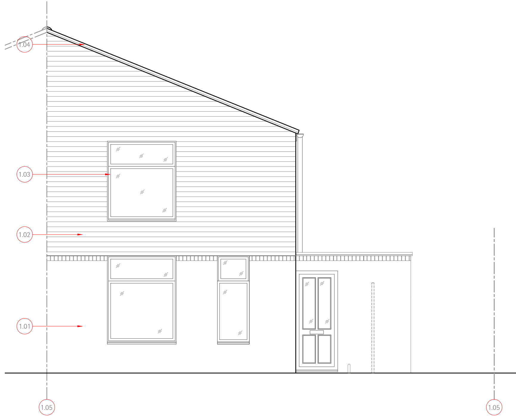
EX EXISTING ELEVATION A SCALE 1:100 @A3