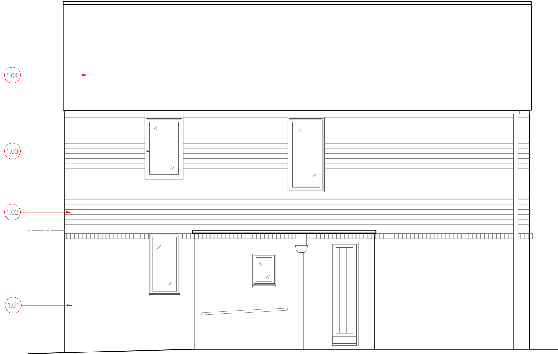
EX EXISTING ELEVATION B SCALE 1:100 @A3