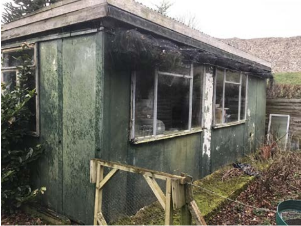
Garage/Workshop to be demolished