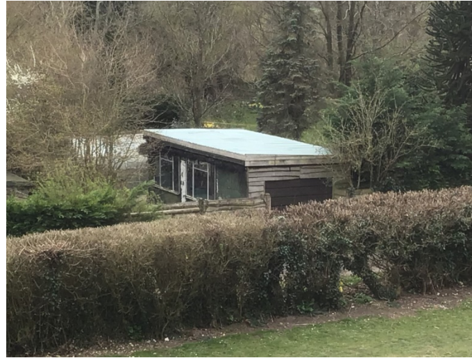
View of Garage/Workshop roof from Castle Wall