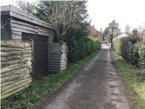
Cuckstool Lane looking towards Bailey Street