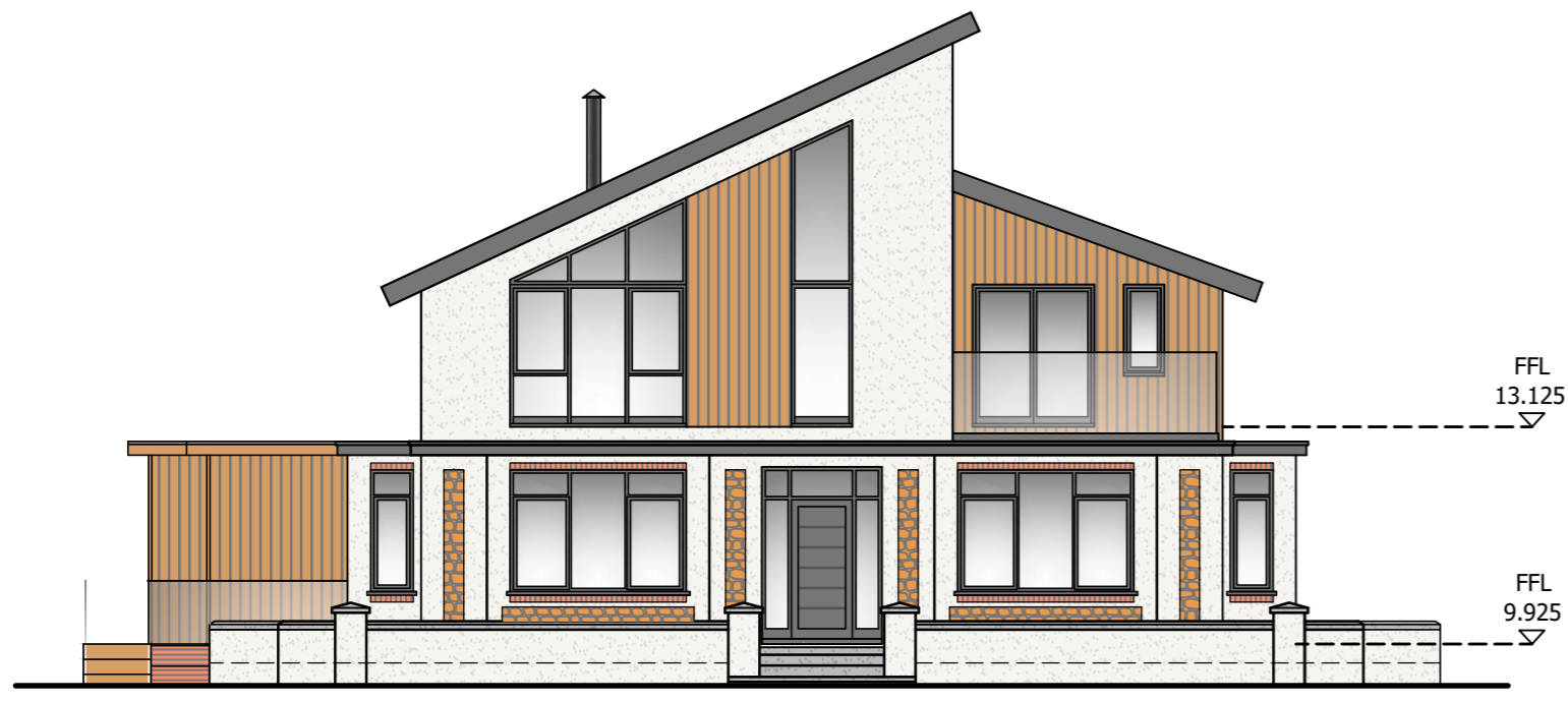
East Elevation 1:100