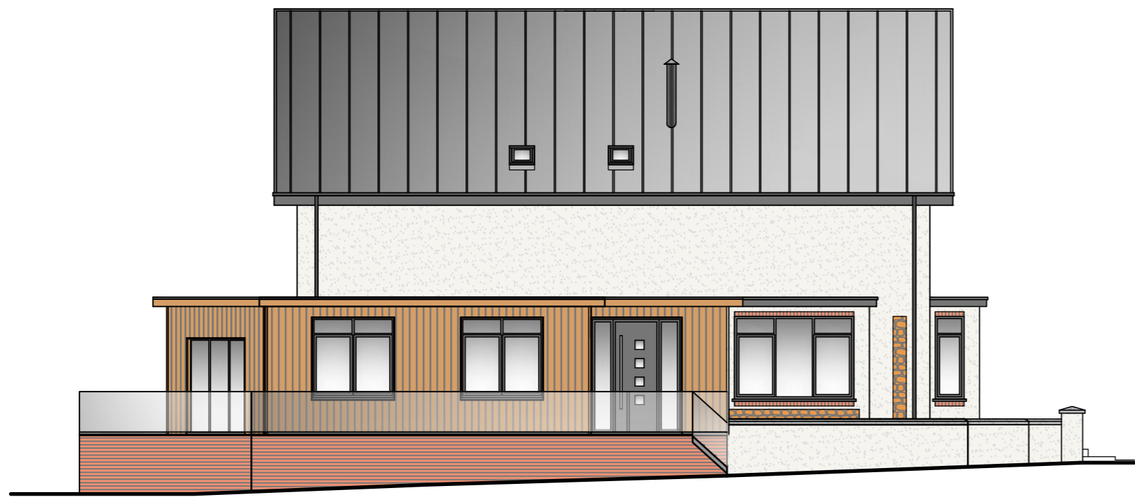
East Elevation 1:100