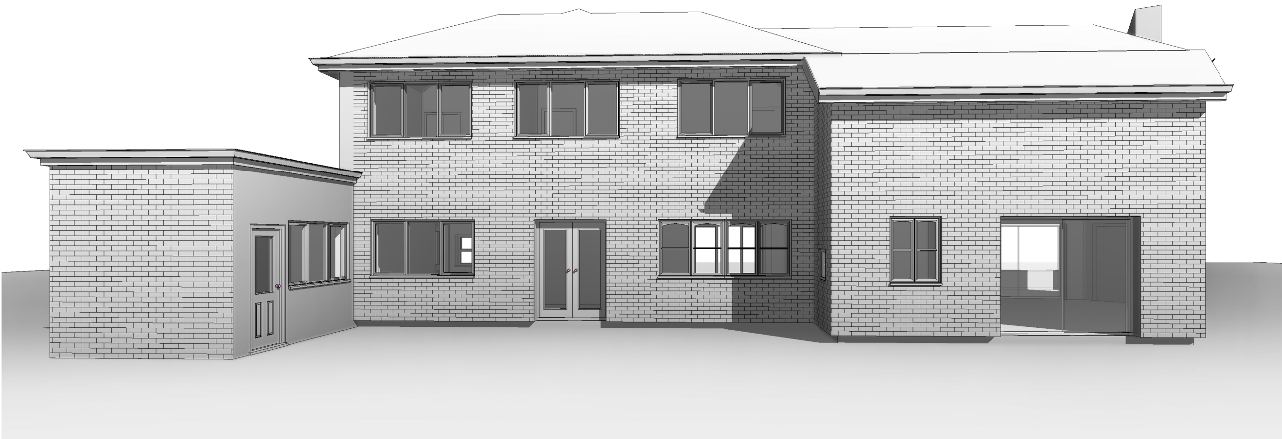
Existing 3D Views

All dimensions to be checked on site. No dimensions to be scaled from this drawing. All Contractors must visit site and be responsible for taking and checking all dimensions relative to this work. The Architect must be advised of any discrepancies in writing.