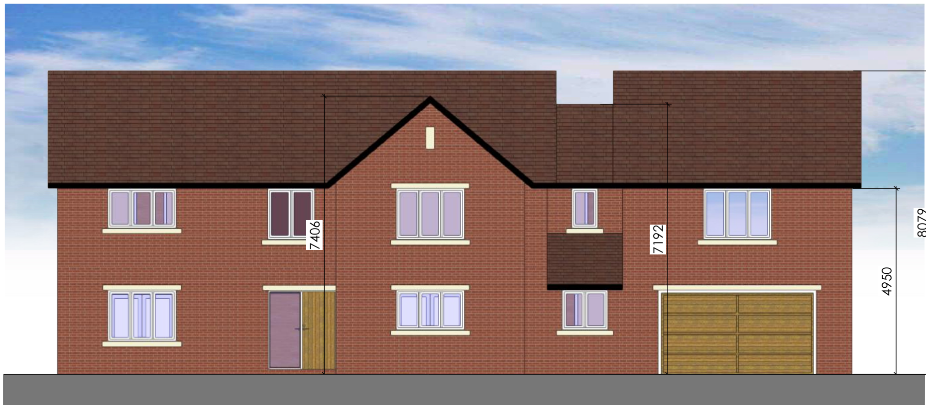
PROPOSED FRONT ELEVATION (1:100)