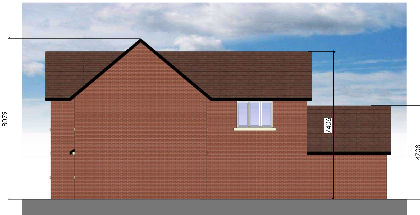
PROPOSED RIGHT ELEVATION (1:100)