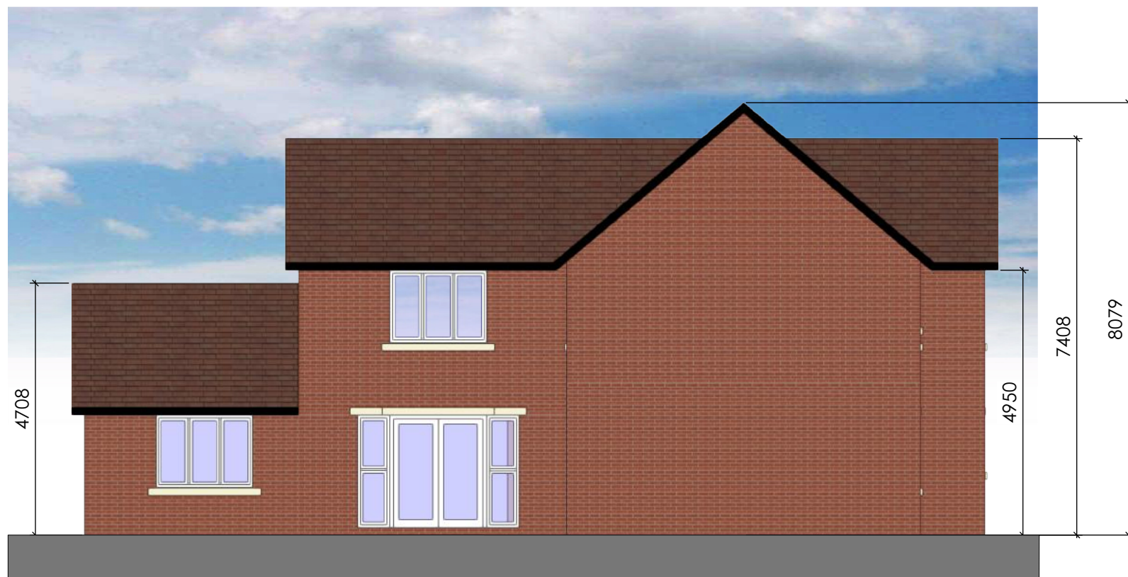
PROPOSED LEFT ELEVATION (1:100)