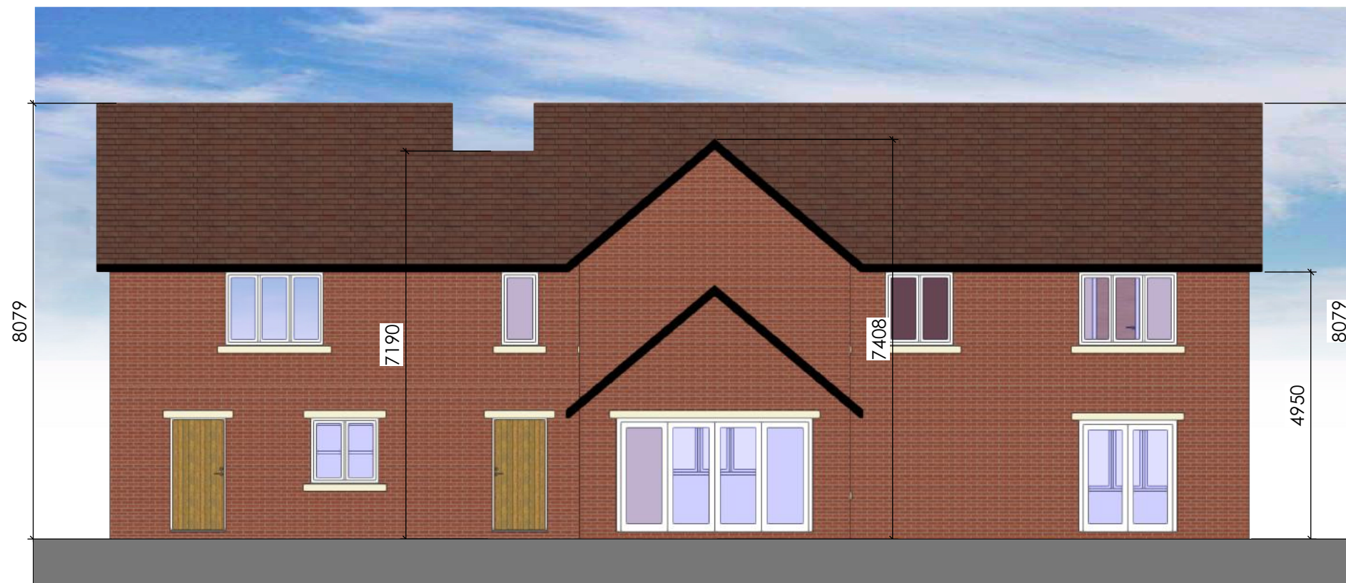
PROPOSED REAR ELEVATION (1:100)