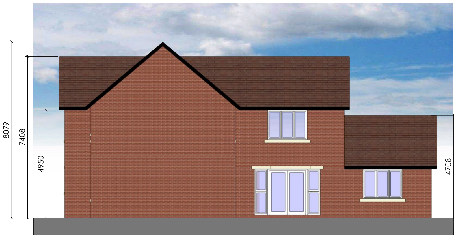
PROPOSED RIGHT ELEVATION (1:100)