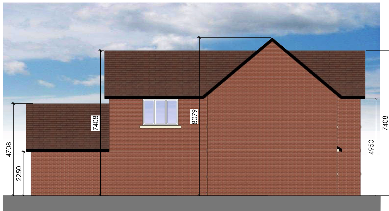
PROPOSED LEFT ELEVATION (1:100)