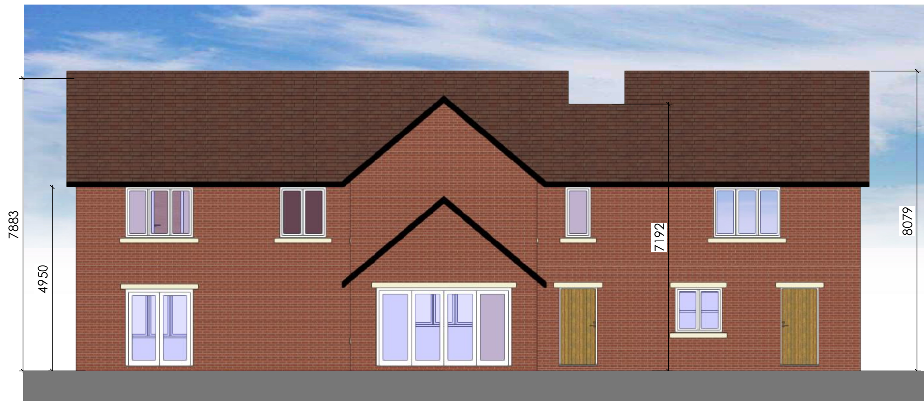
PROPOSED REAR ELEVATION (1:100)