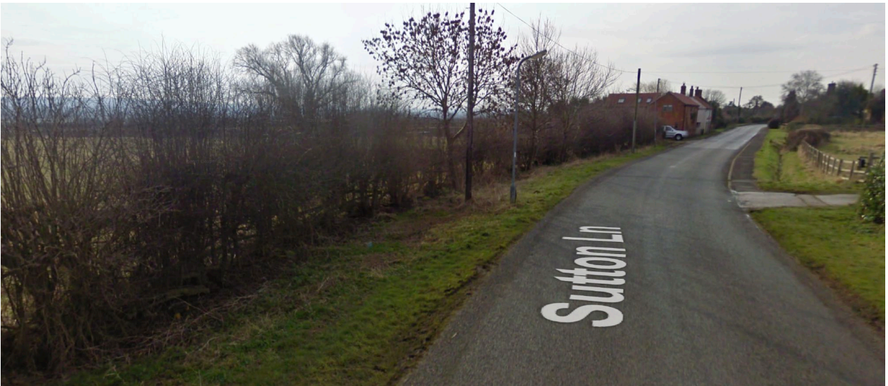
View of Sutton Lane towards across application site. - Shrubs and Trees retained as screening.