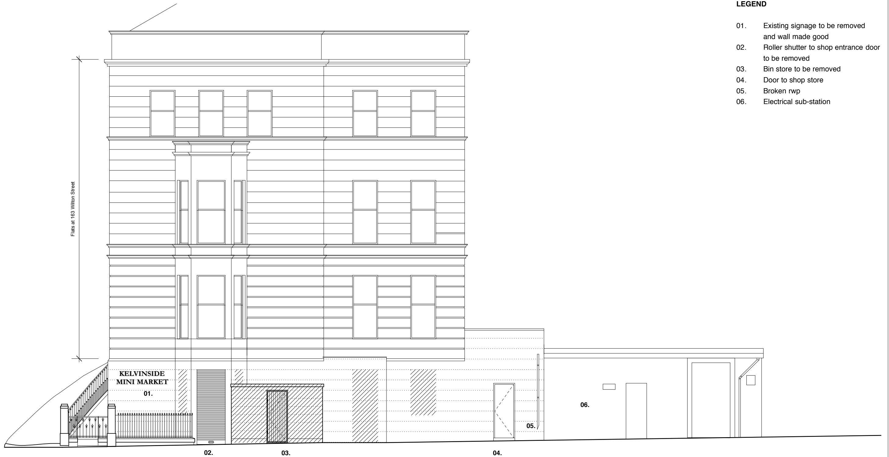
Existing Elevation to Yarrow Gardens Lane