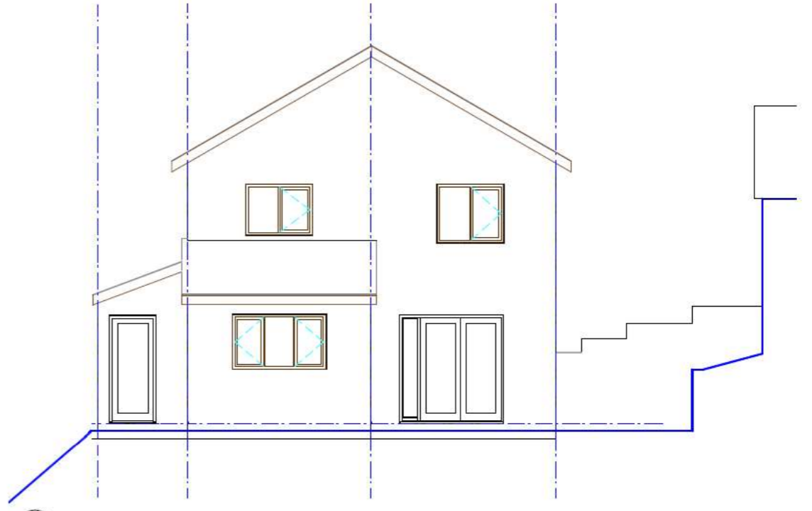
02 West Elevation 1:100